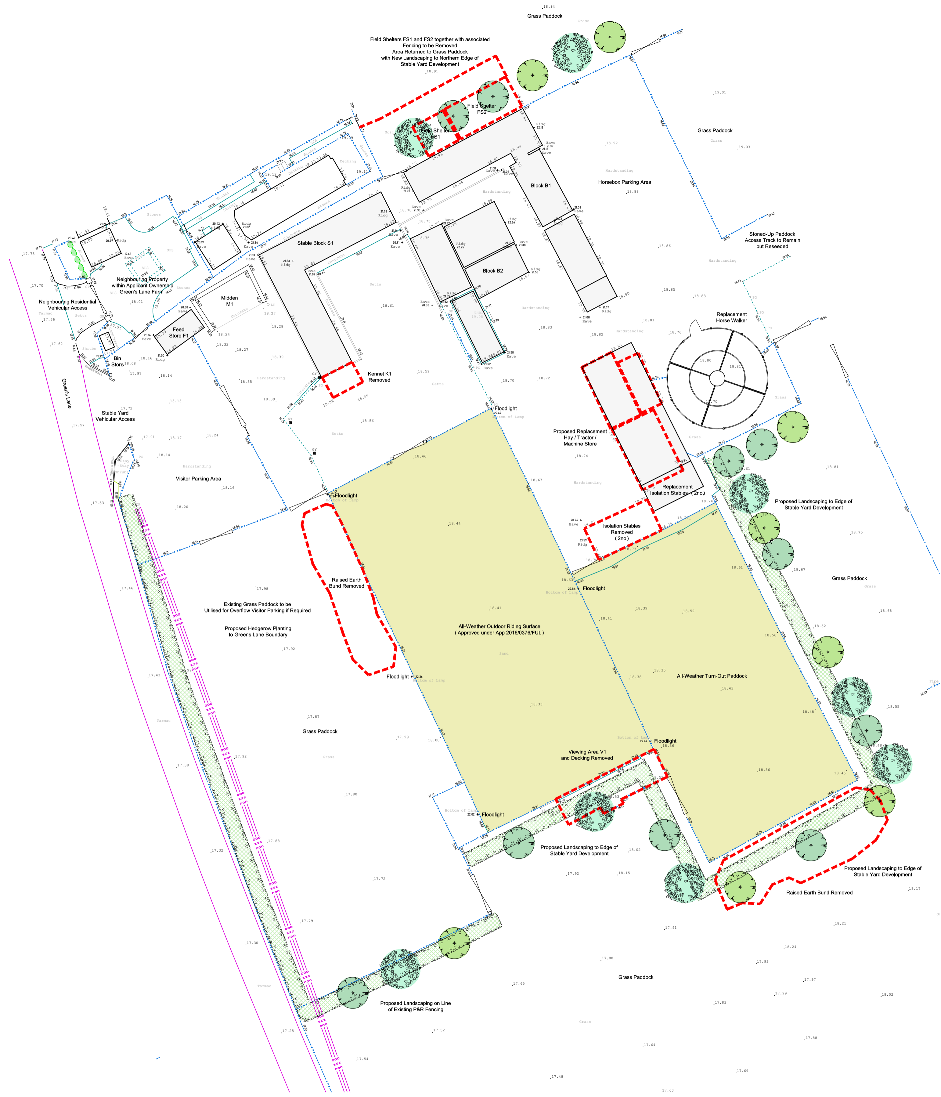
Proposed Site Plan Scale 1/250