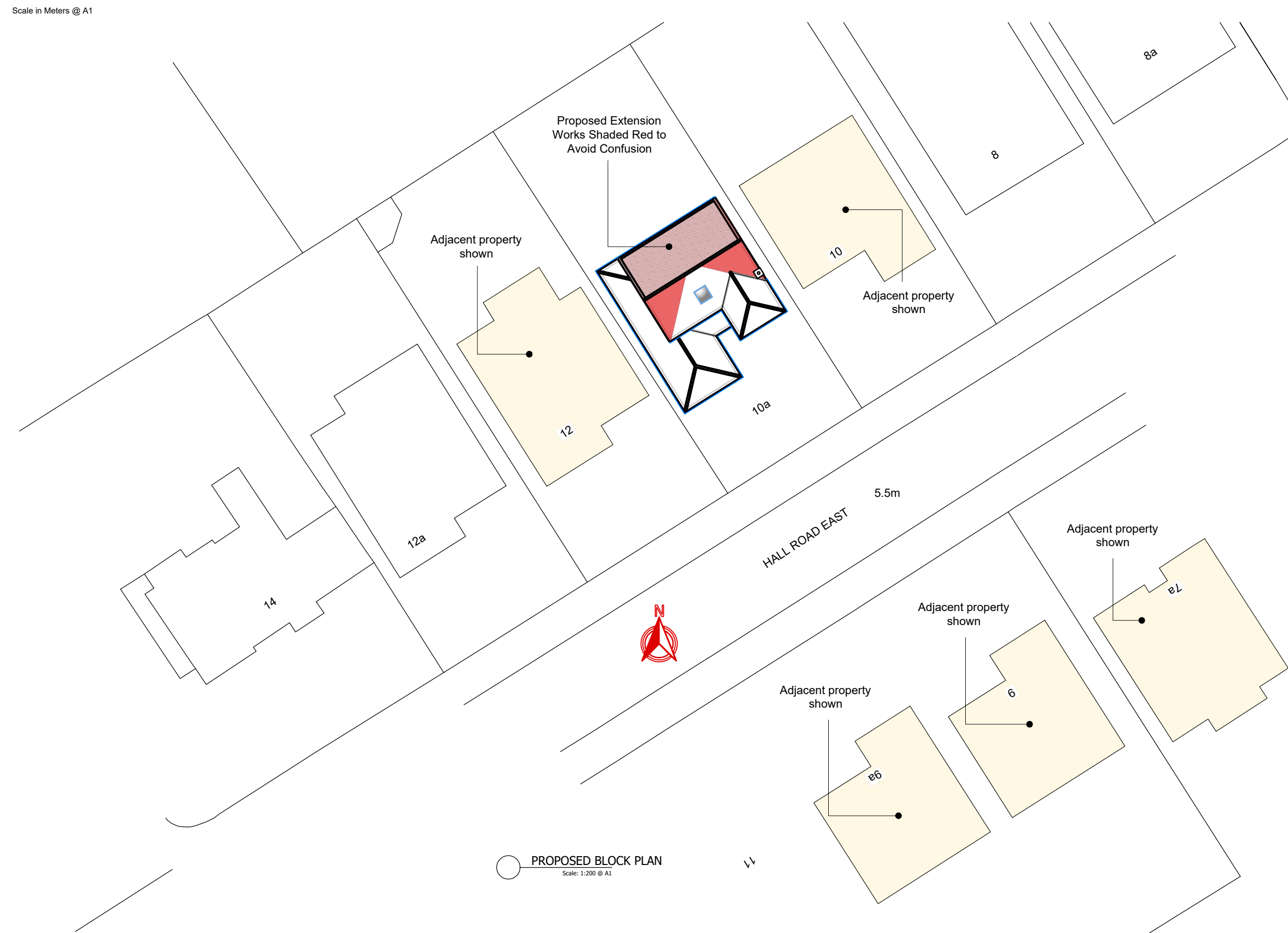
PROPOSED BLOCK PLAN Scale: 1:200 @ A1