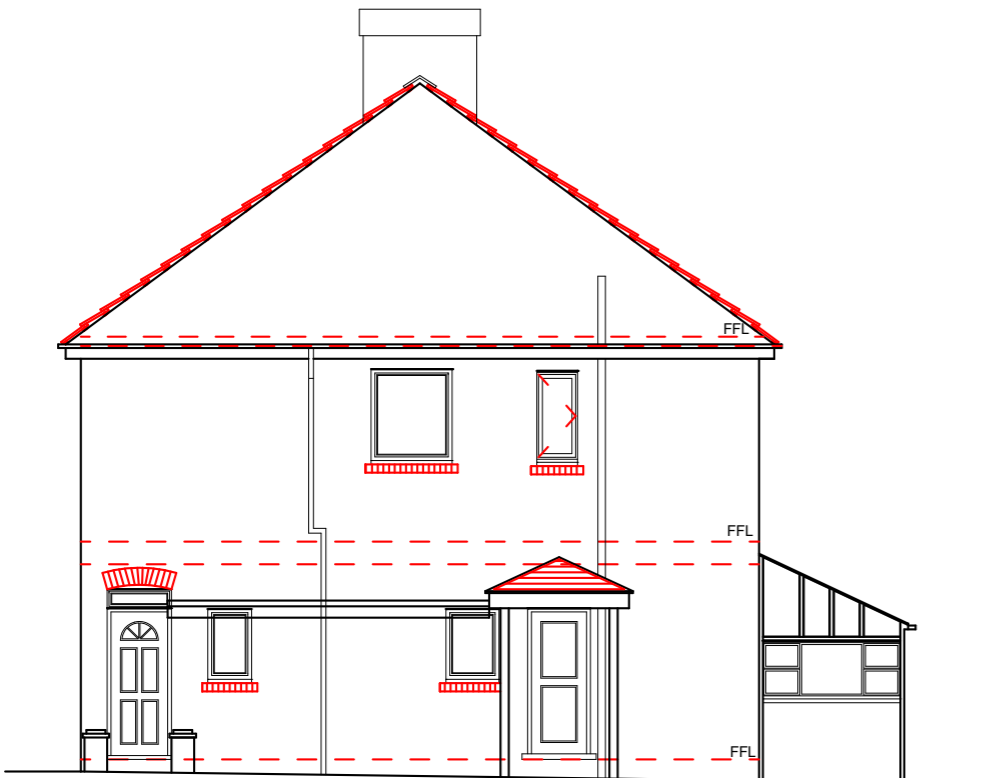
EXISTING RIGHT SIDE ELEVATION