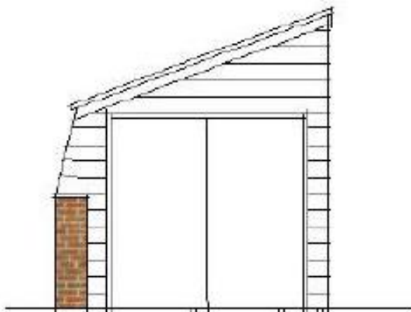
Left side of Shed