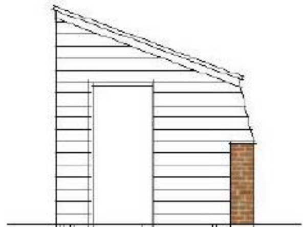
Right side of Shed

Project Title 2303 Lawshall Church Drawing Title Proposed elevations Drawing No 2303.05.002 Page 4 Scale 1:50 Date 29 January 2024 Drawing Size A4