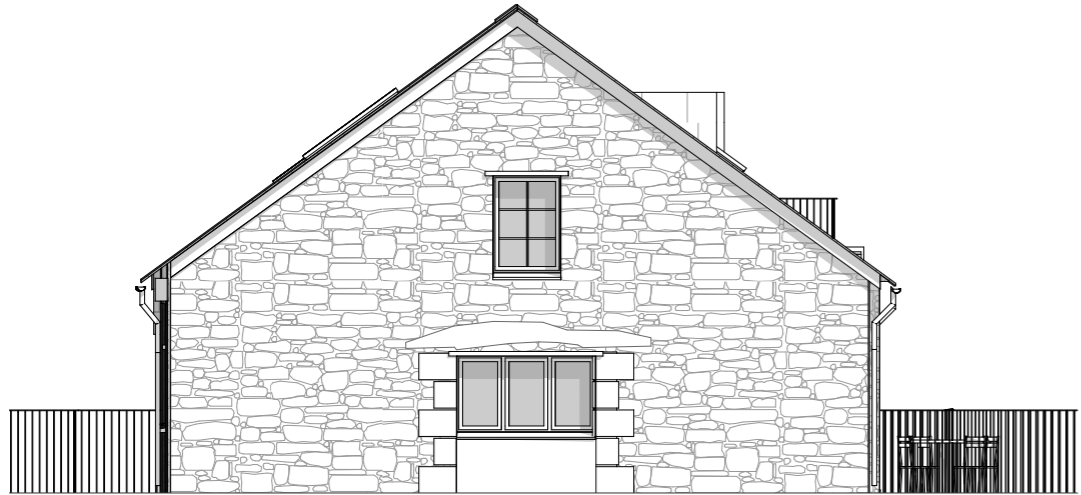
PROPOSED SOUTH ELEVATION 1:100