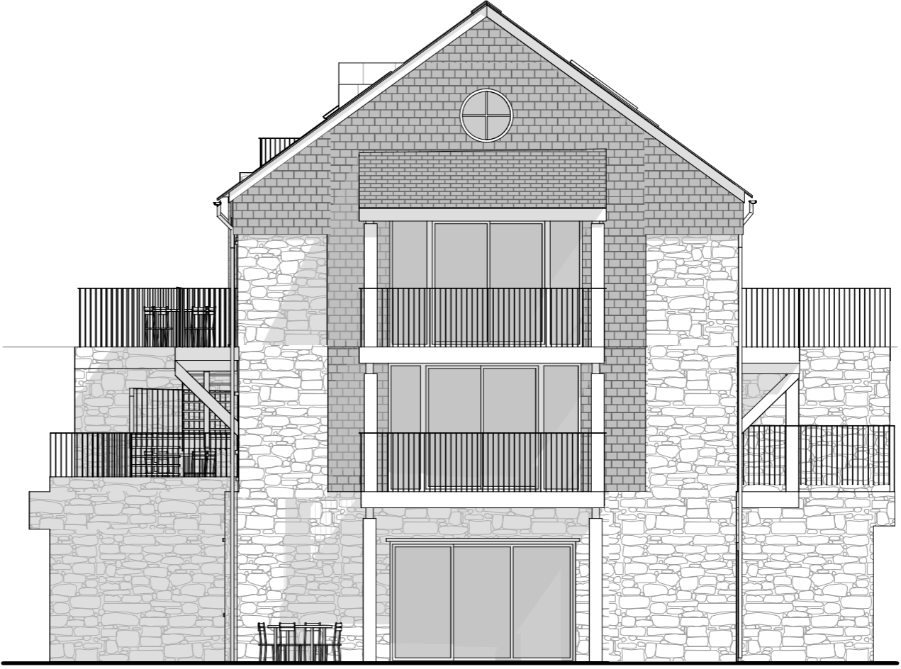
PROPOSED NORTH ELEVATION 1:100