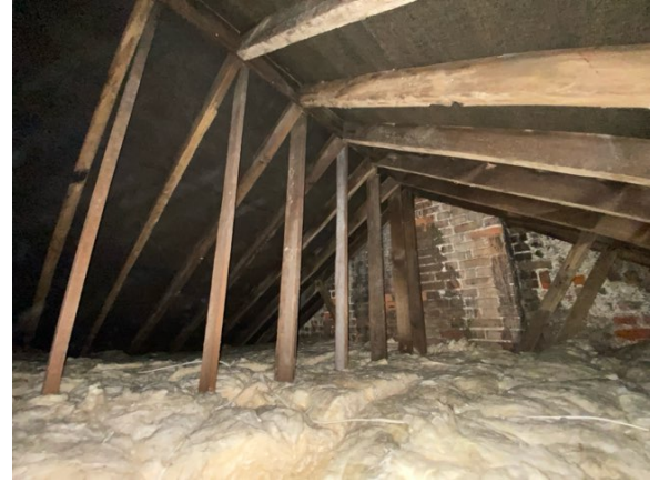
4. Quilt insulation