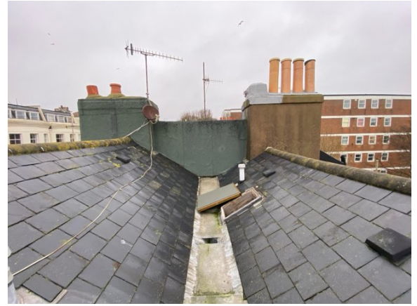
2. Central roof valley