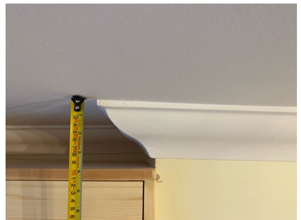
8. Ogee cornice