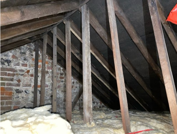
5. Hessian/bitumen slate underlay