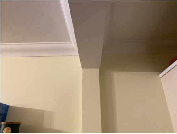
1. Central beam