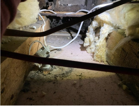
3. Plasterboard ceilings