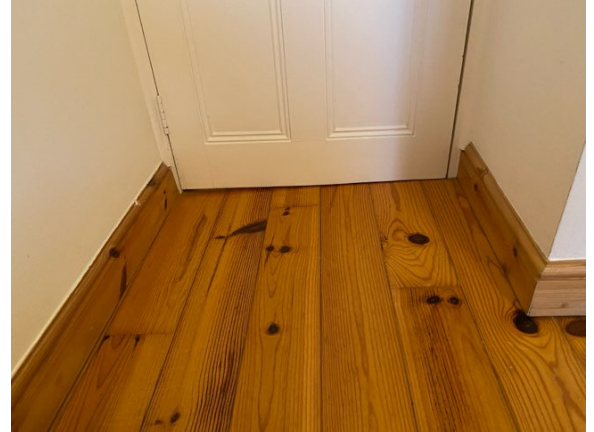
6. Pine flooring