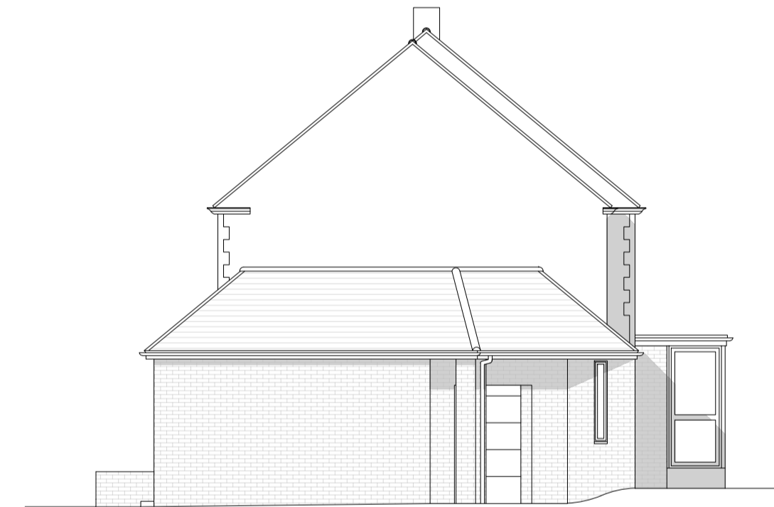
Proposed Side Elevation 1:100