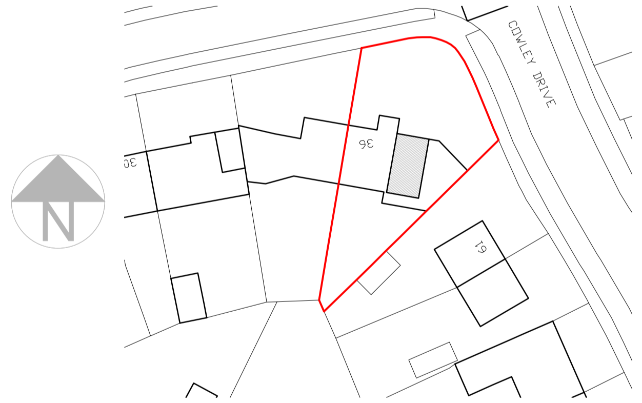
Block plan 1:500