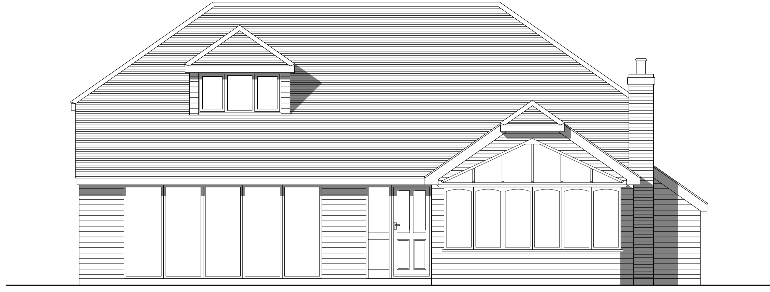
FRONT ELEVATION (EAST)