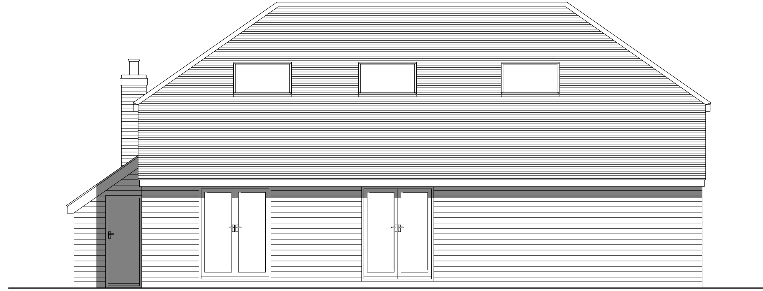
REAR ELEVATION (WEST)