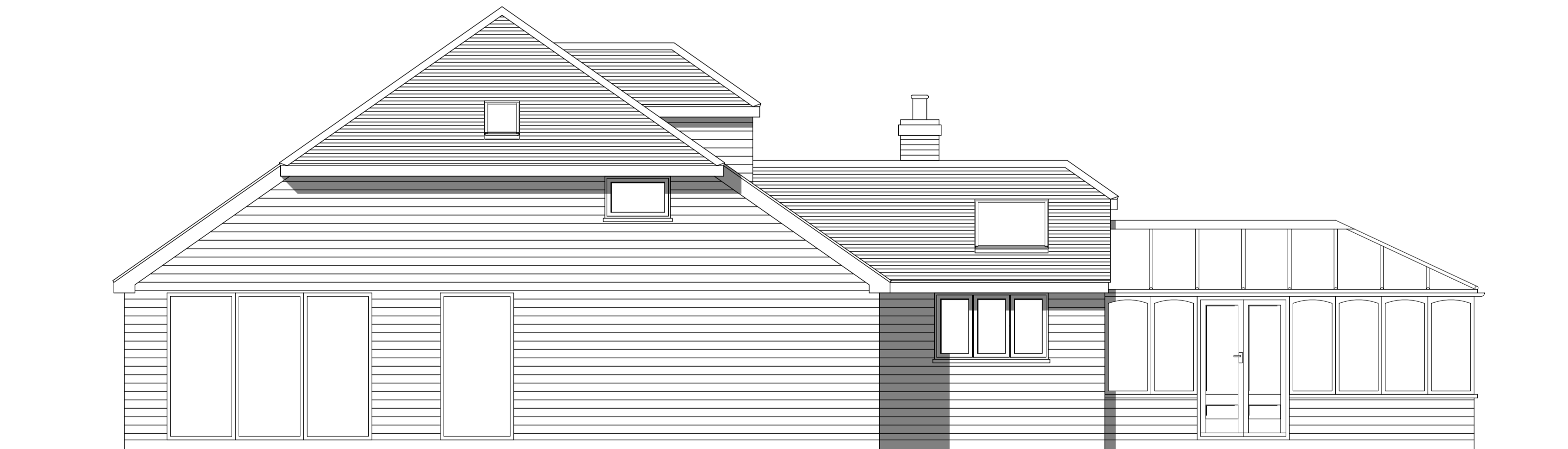
SIDE ELEVATION (SOUTH)