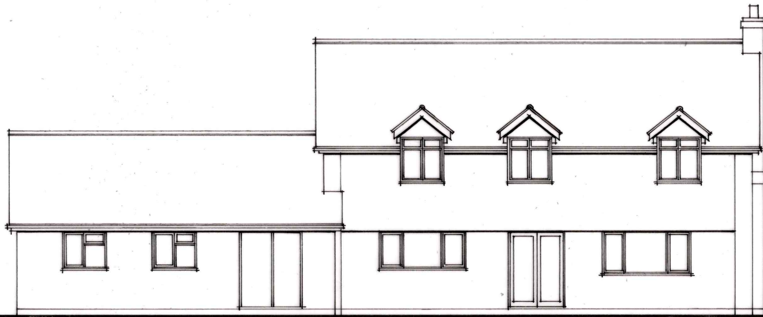
front elevation. 1:100