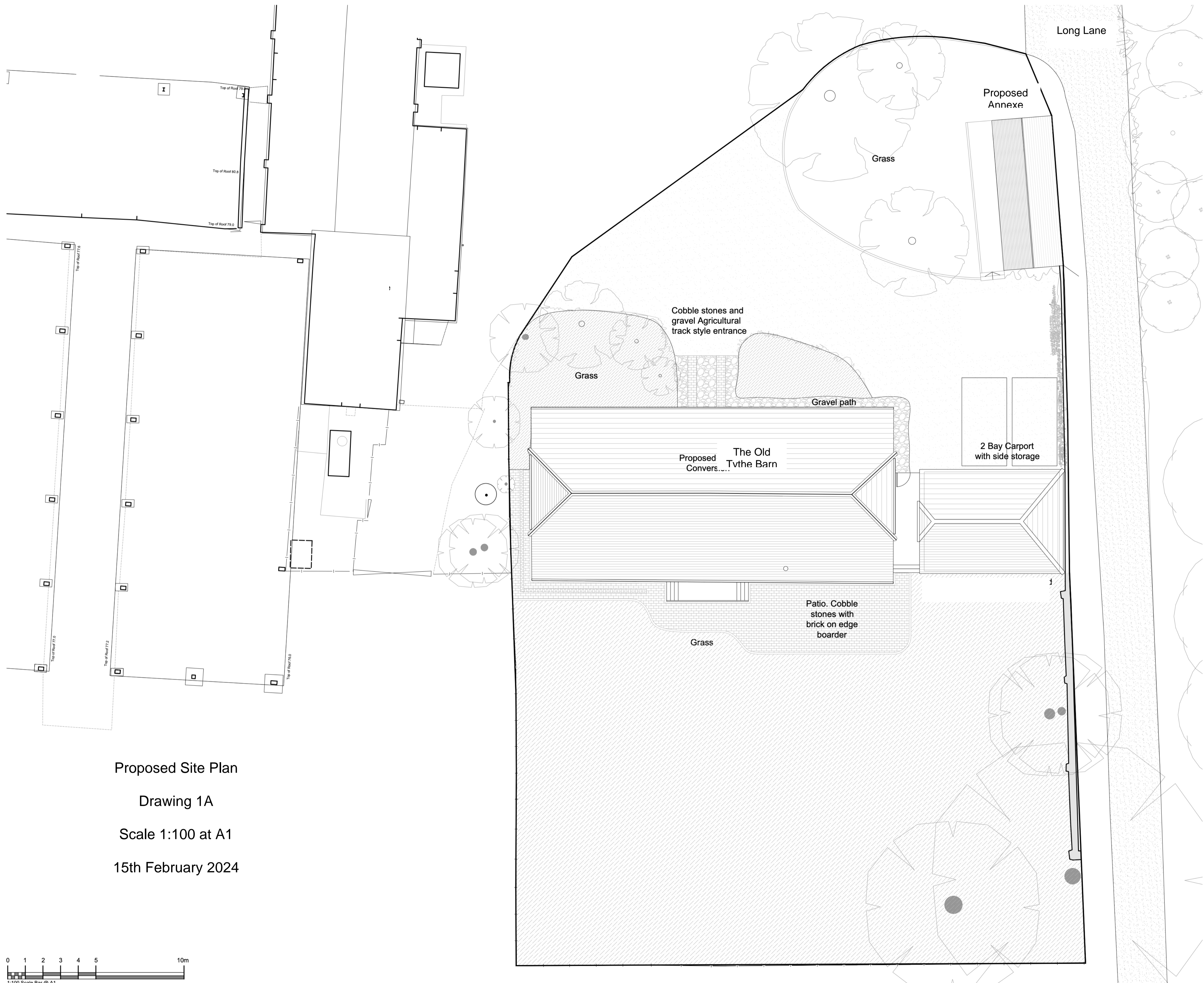
Proposed Site Plan Drawing 1A Scale 1:100 at A1 15th February 2024