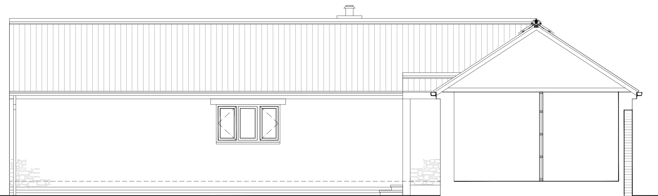
PROPOSED SECTIONAL SIDE ELEVATION EAST FACING.