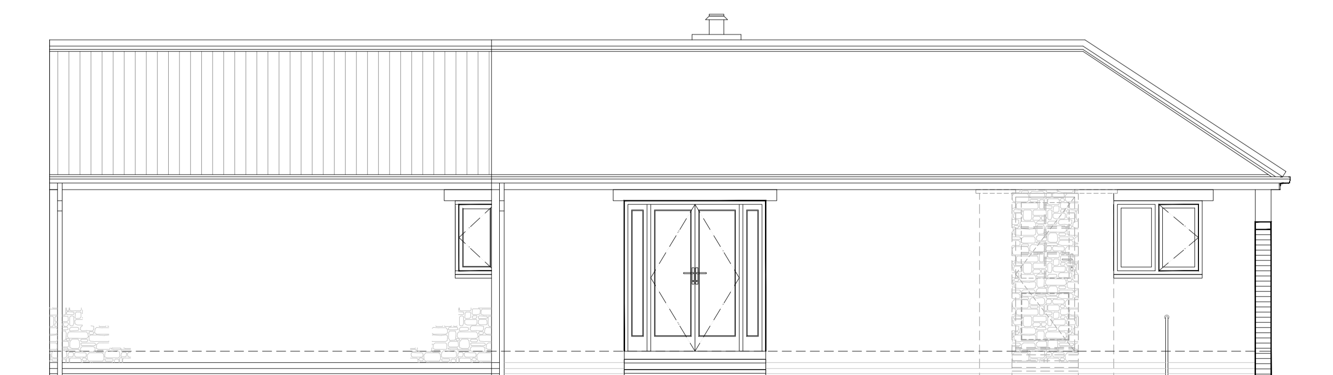
PROPOSED SIDE ELEVATION. EAST FACING

STONE PIERS & STEPS TO BE REMOVED. EXISTING DOORWAY BLOCKED UP and WALL MADE GOOD.