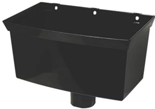
Rainwater Goods – Black UPVC to match existing – Half-round gutters with circular downpipes