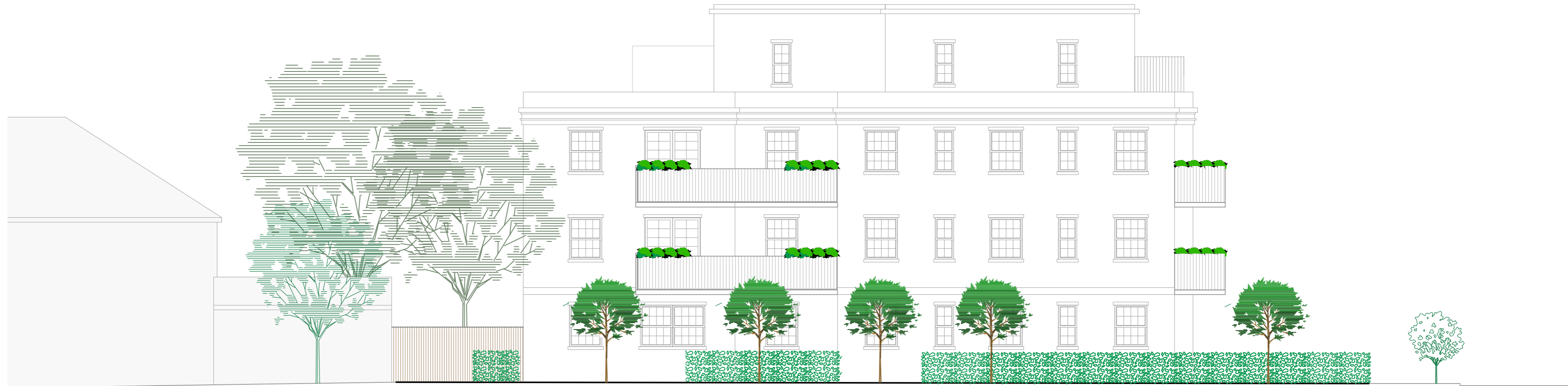
Proposed Side Elevation Scale 1:100

IMPORTANT GENERAL NOTE The specification is to be read in conjunction with the plans/section details, and other associated structural details as may be provided. All work is to be carried out to the Local Authority Planning and Building Regulations Approval, and the Codes of Practice and British Standards as necessary. All dimensions, levels, sizes, positions and locations of particulars as indicated on drawings are to be verified by the appointed Contractor on site prior to engaging in works. Any discrepancies must be reported to the Architect/Supervisor/Engineer or responsible person/s immediately. The Contractor is responsible for ensuring compliance with the CDM Regulations, and appropriate Health & Safety on site precautions. The Client/Building Owner must obtain any necessary PARTY WALL AGREEMENTS, prior to engaging in the works on site.