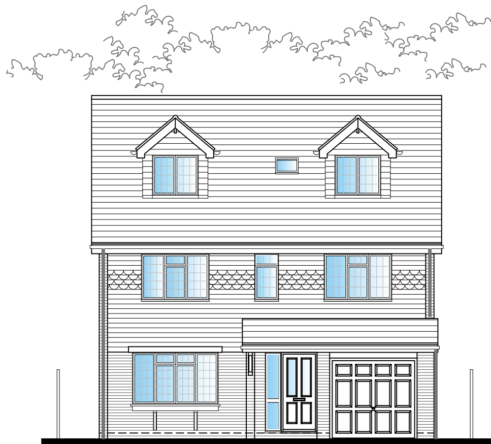
Existing Front Elevation (1:100)