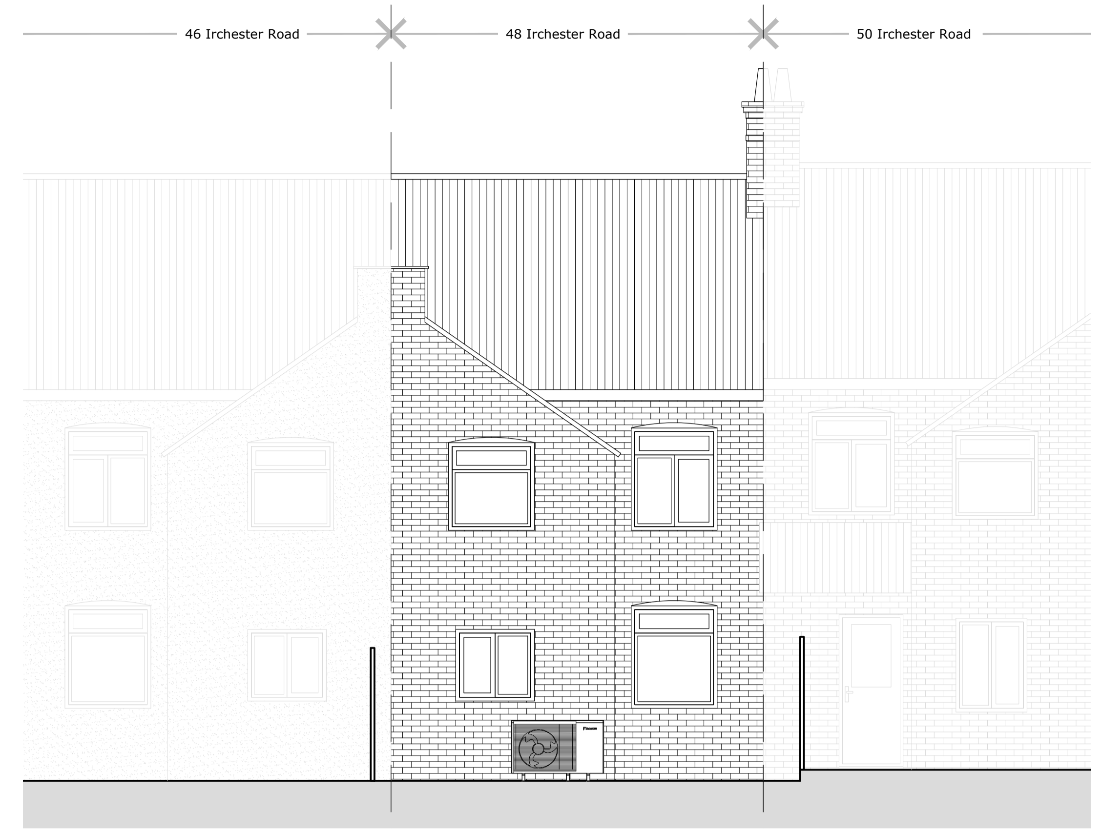
South Elevation as PROPOSED 1:50