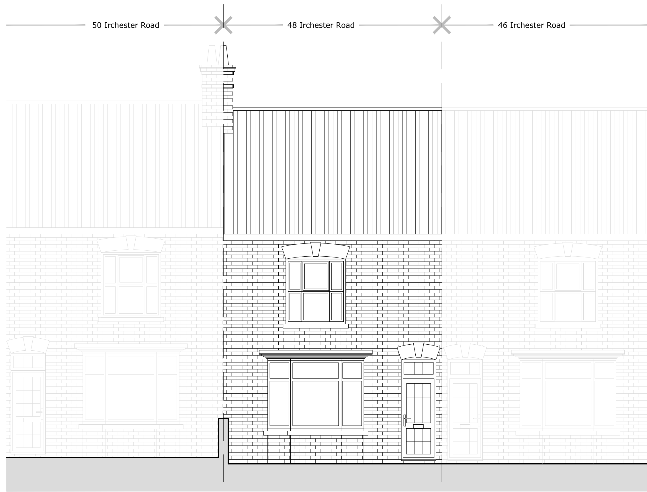
North Elevation as EXISTING 1:50