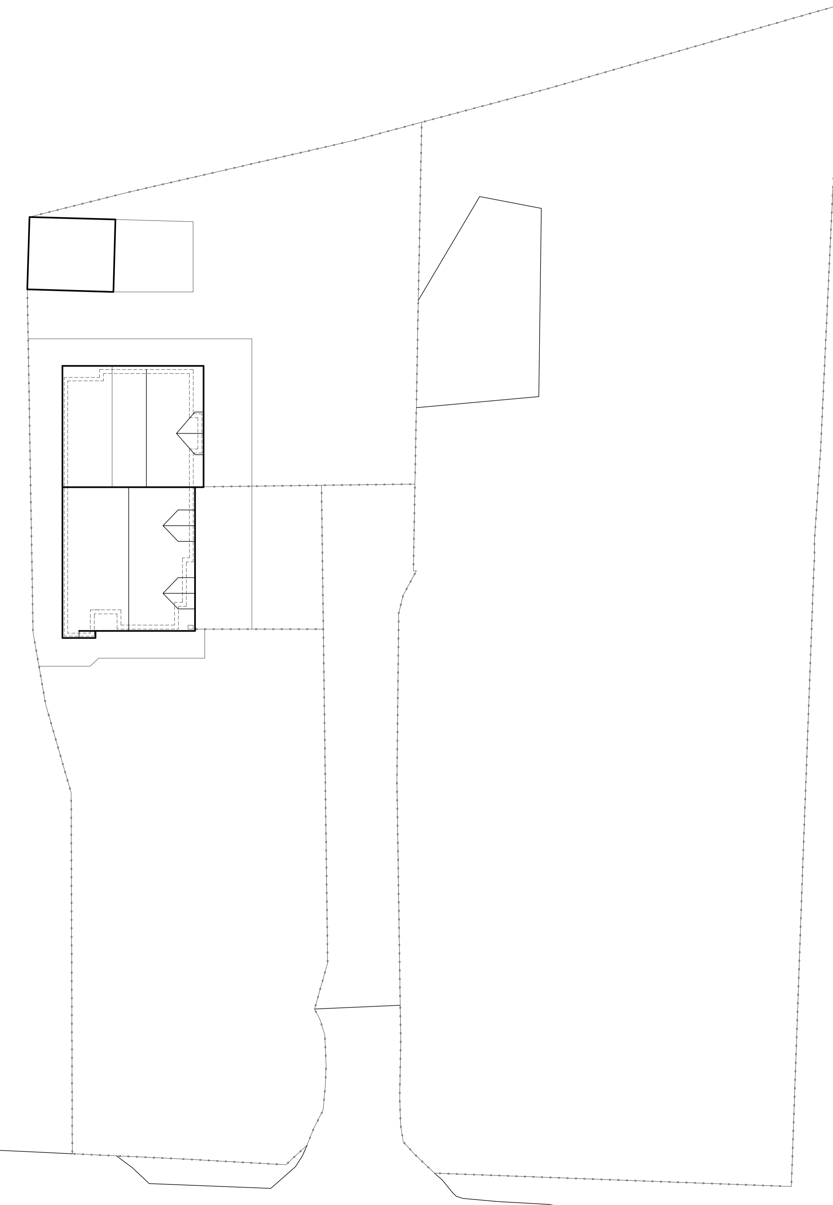
SITE LAYOUT TOTAL FLOOR AREA 585 m 2