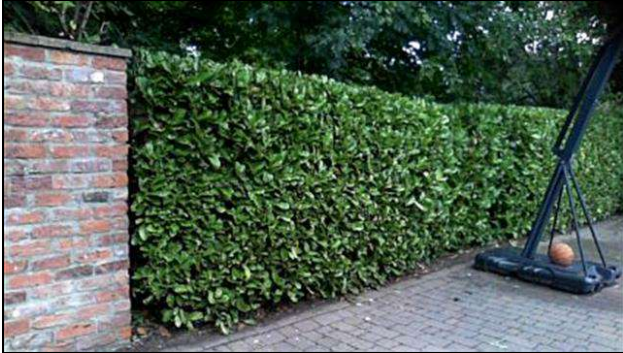
H1 - Laurel (Cherry)