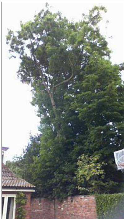
T2 - Ash