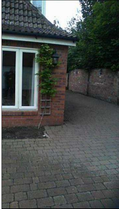
C1 - Wisteria