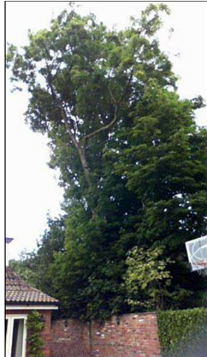
T1 - Sycamore