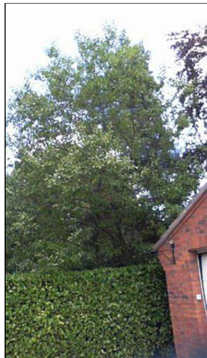
T3 - Willow (Goat)