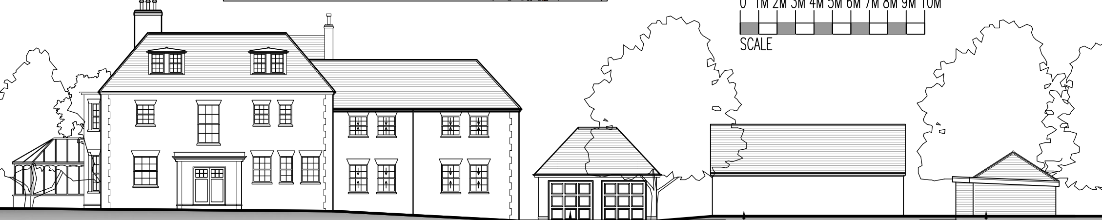
Structure 1: Garage Structure 2: Garage/carport/annexe Structure 3: Outbuilding