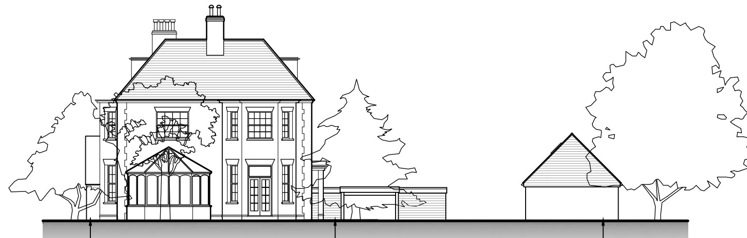
Structure 1: Garage