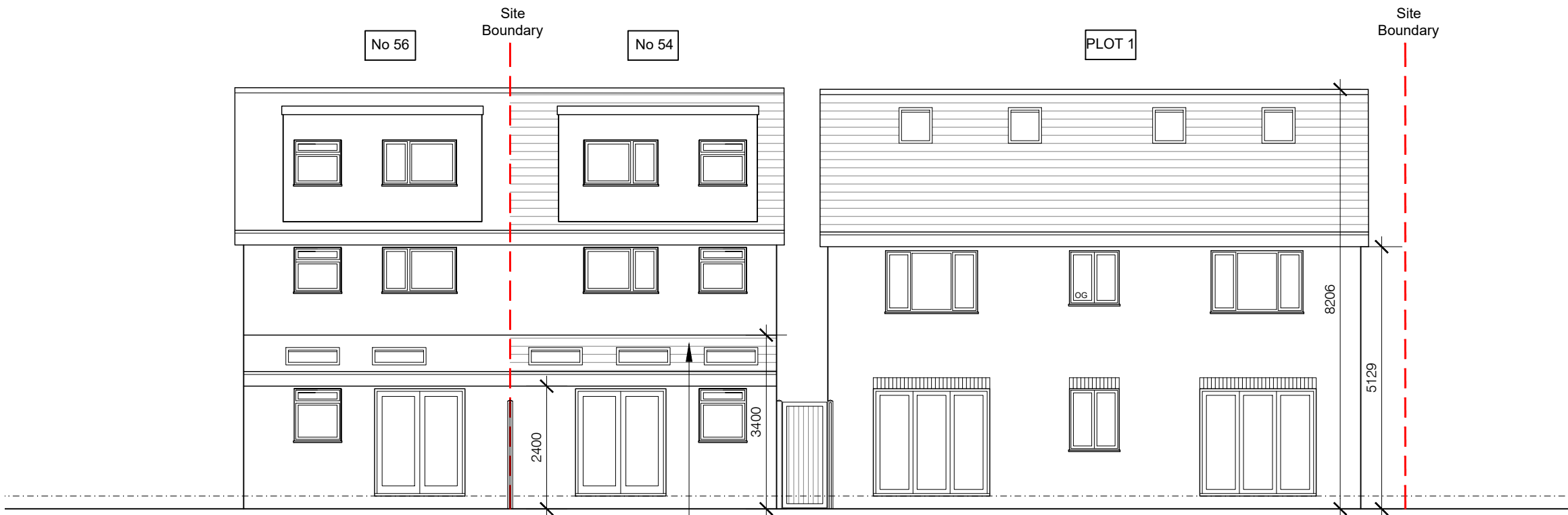
REAR ELEVATION (North)