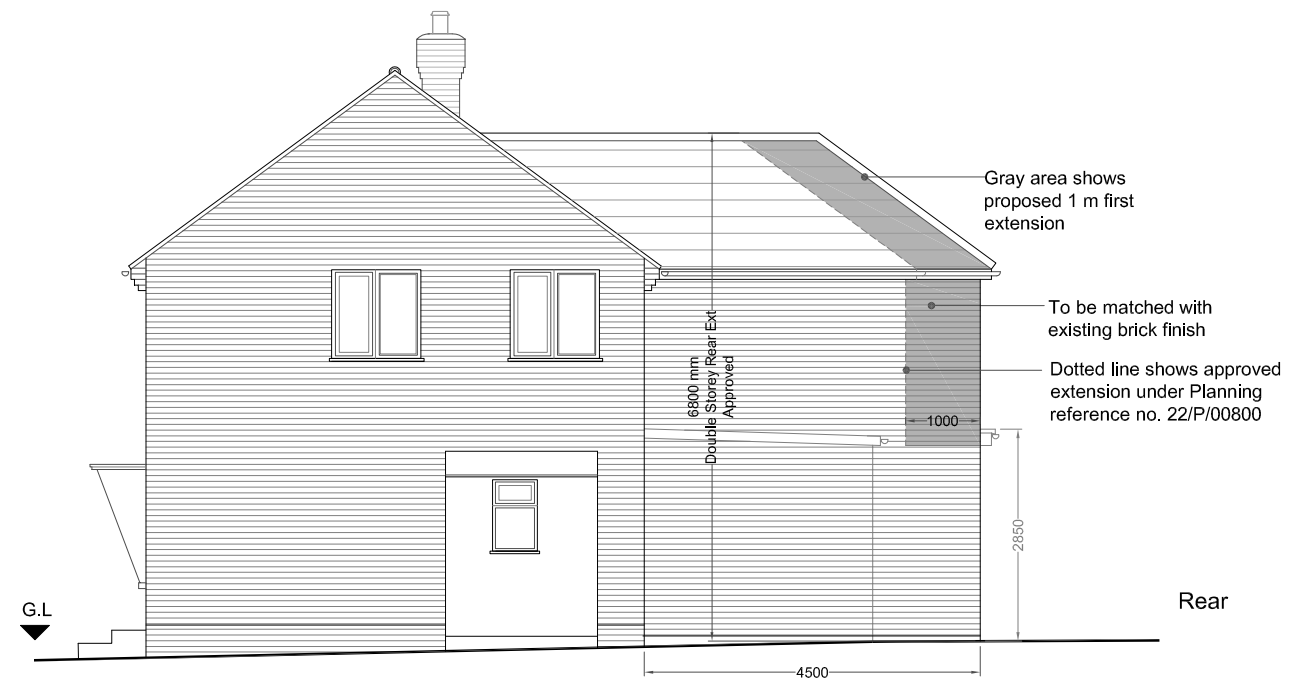
Proposed Side Elevation 1:100