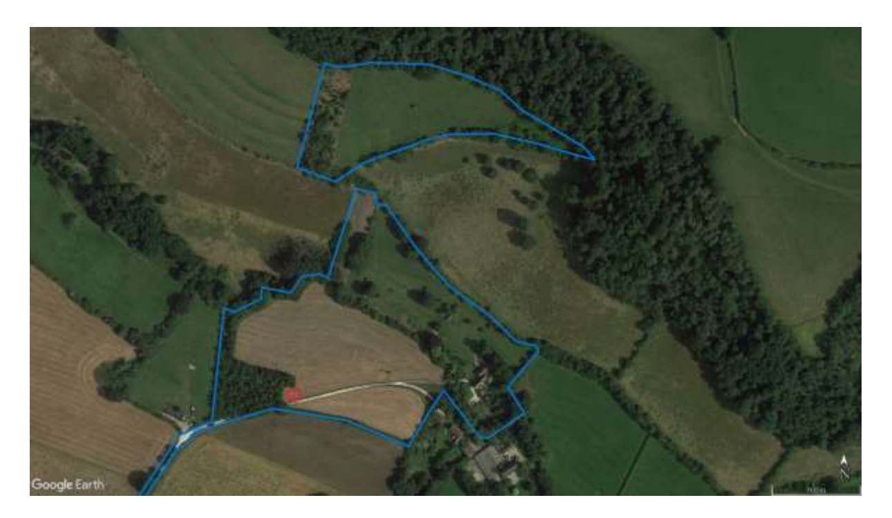
Extract showing the site aerial photo