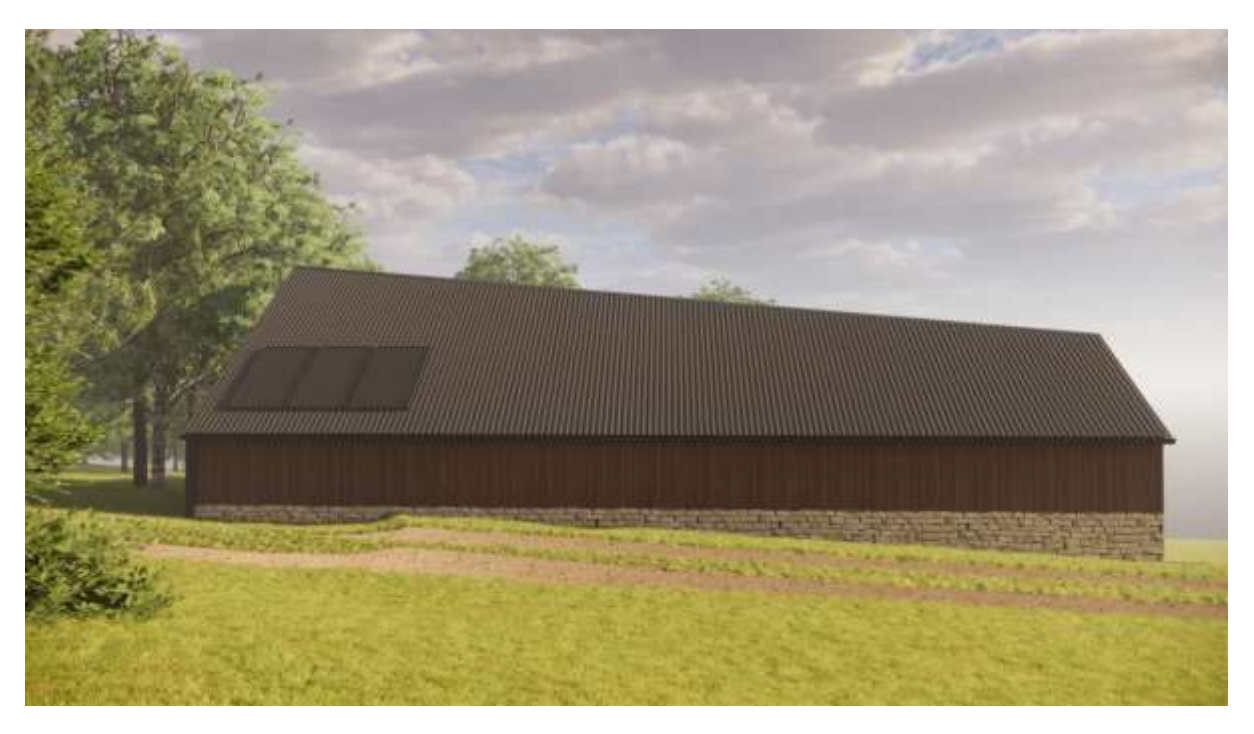
Rendered model view showing the proposed barn from the North – the most visible side.