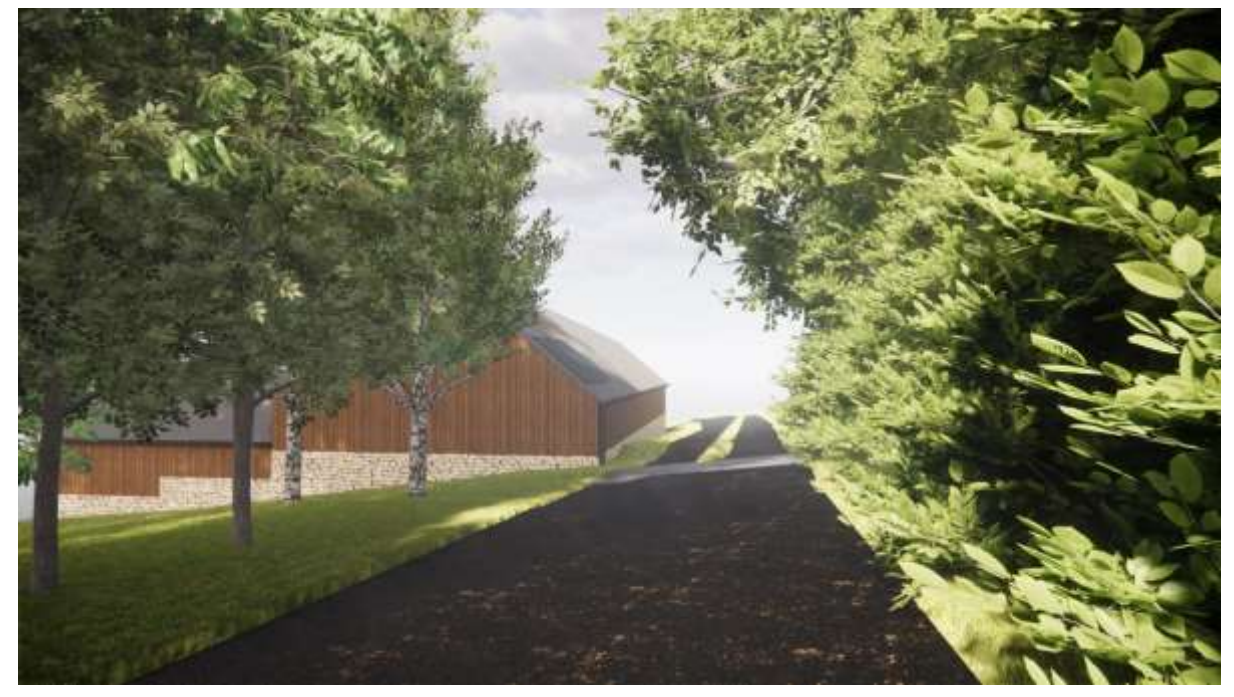
Rendered model view - approaching the site down New Mills Lane