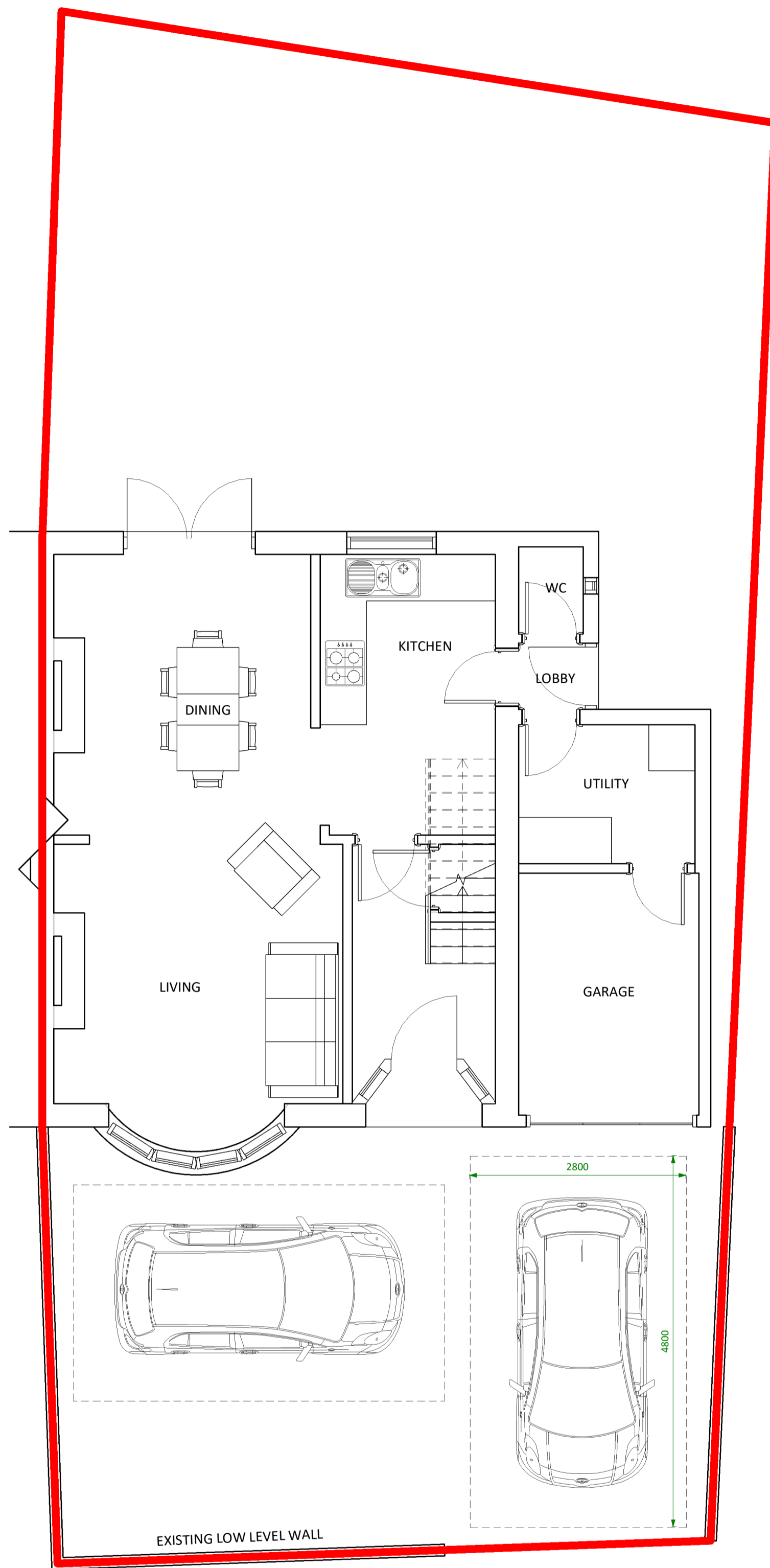
Existing Ground Floor Plan 1:50