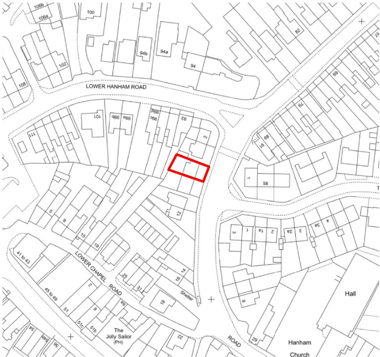
Site Plan 1 : 1250