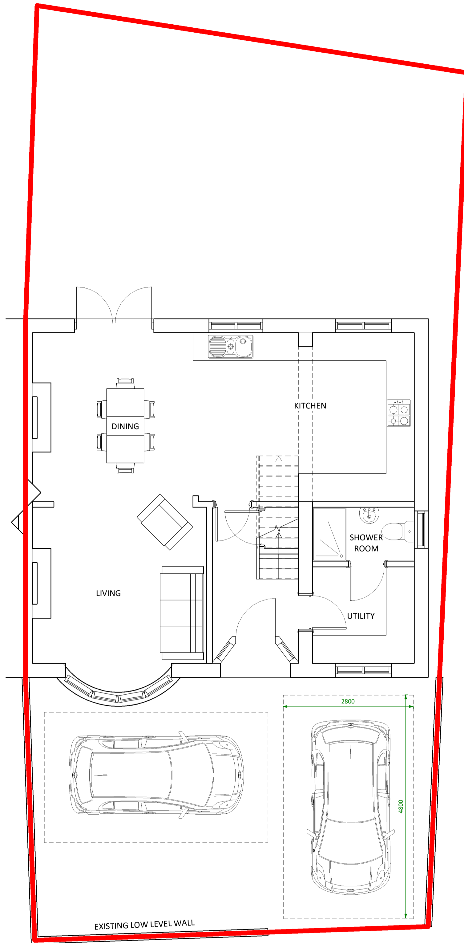
Proposed Ground Floor Plan 1:50