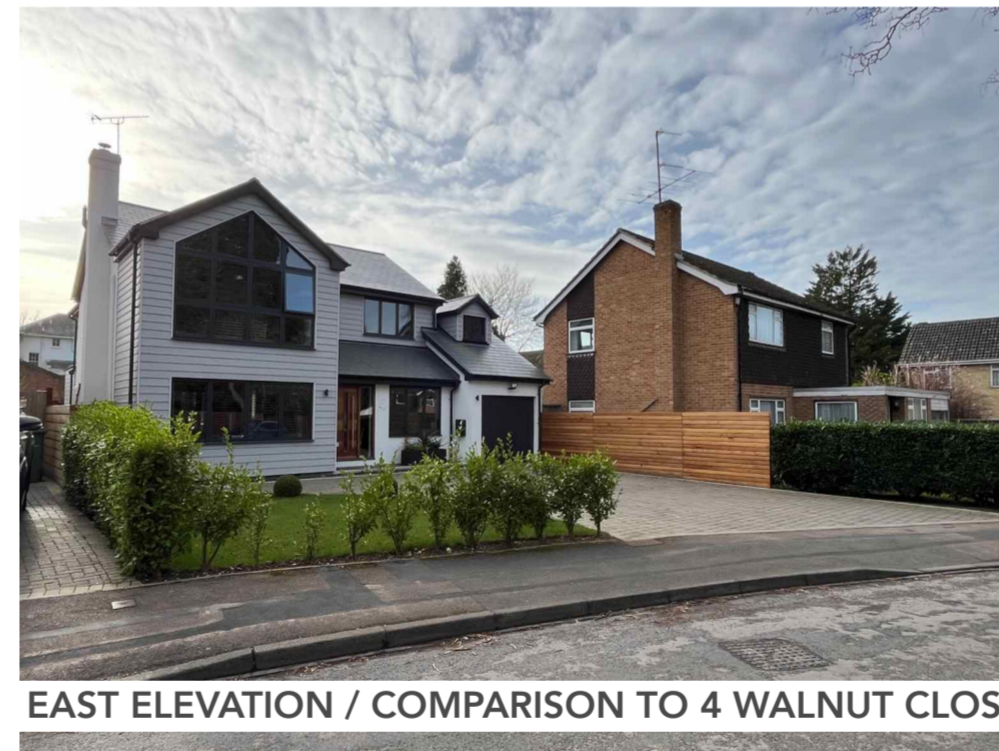
EAST ELEVATION / COMPARISON TO 4 WALNUT CLOSE