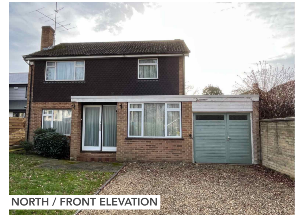
NORTH / FRONT ELEVATION