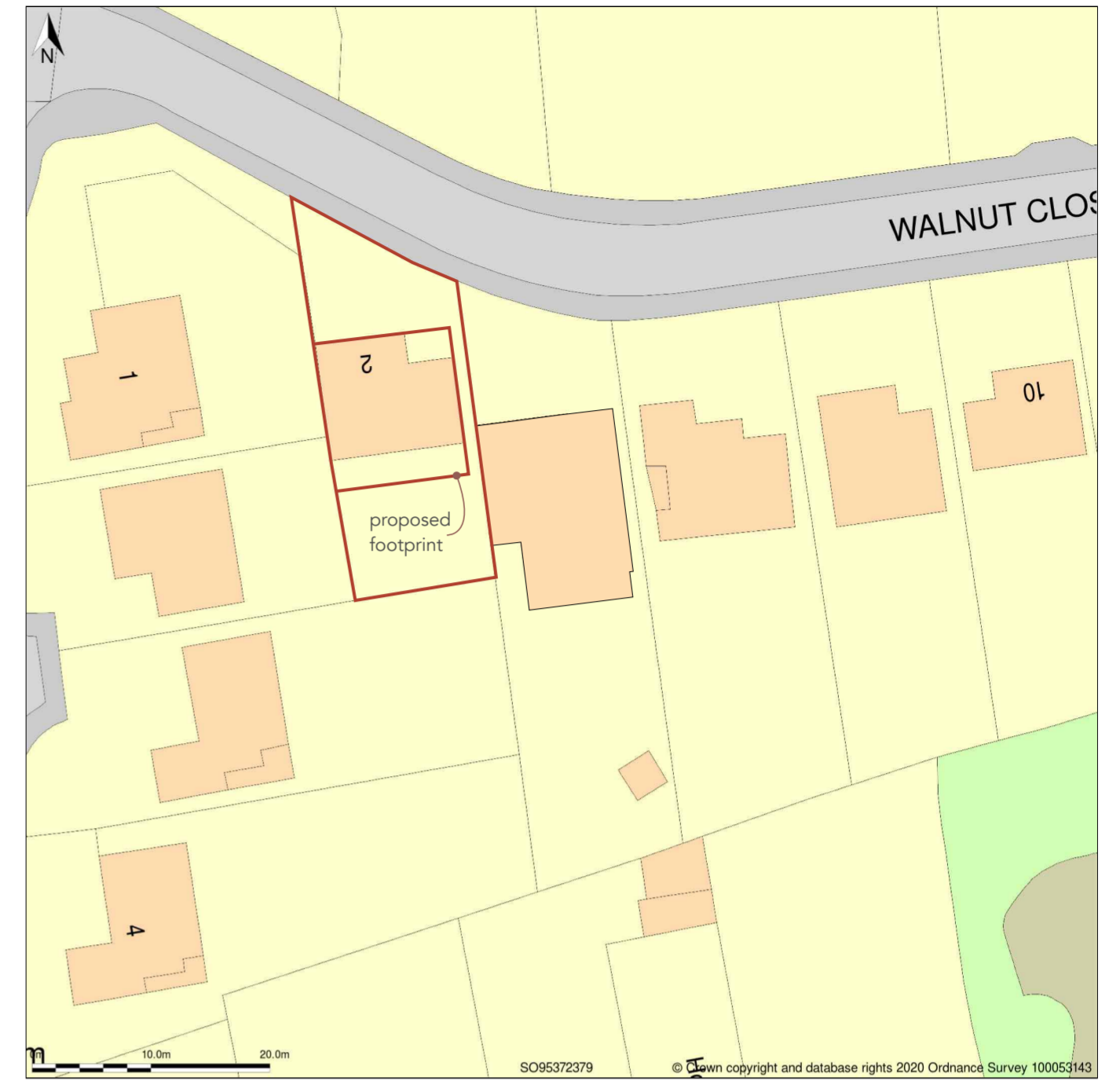
PROPOSED SITE PLAN 1 : 500 @ A2