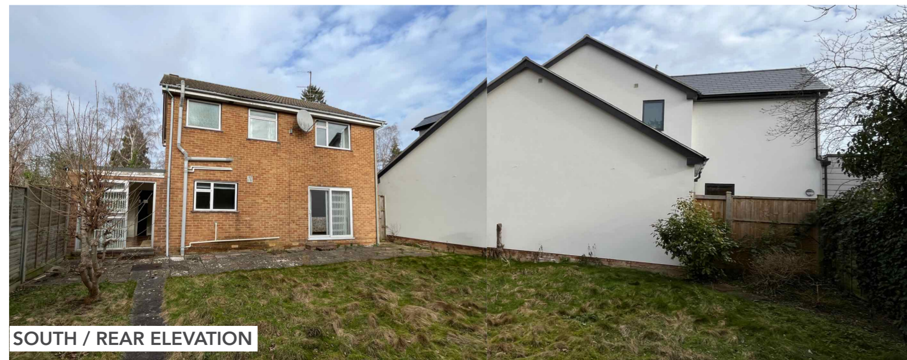
SOUTH / REAR ELEVATION

all dimensions to be confirmed on site all works to be carried out in accordance with current Building Regulations drawings and design copyright of SE Architecture and may not be copied, altered or reproduced without authority