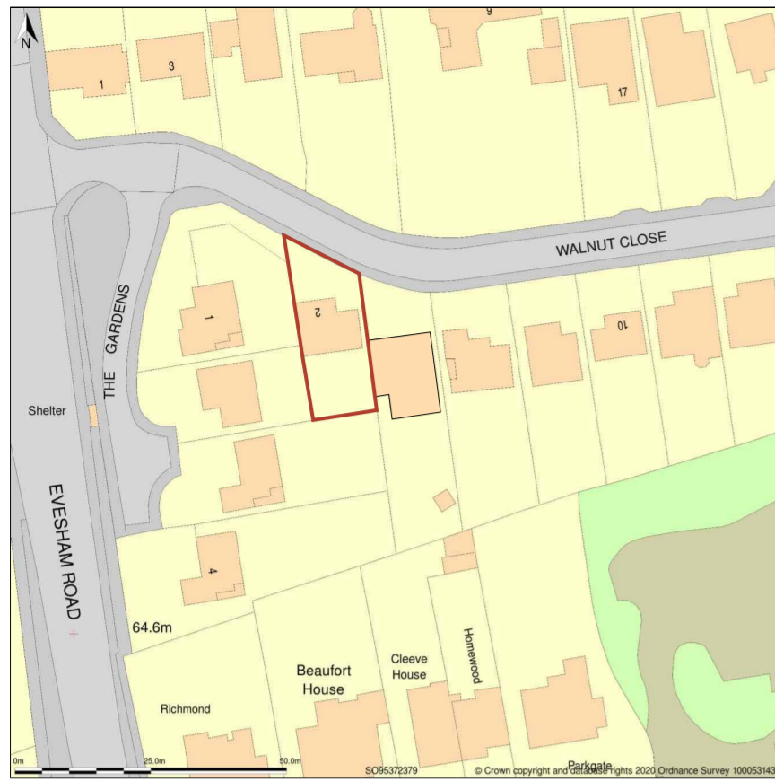
LOCATION PLAN 1 : 1250 @ A2