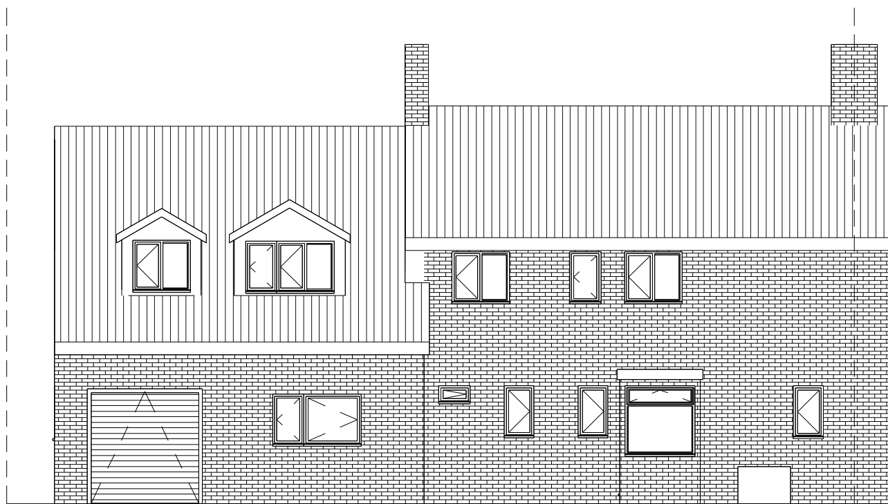
2 Proposed Front Elevation