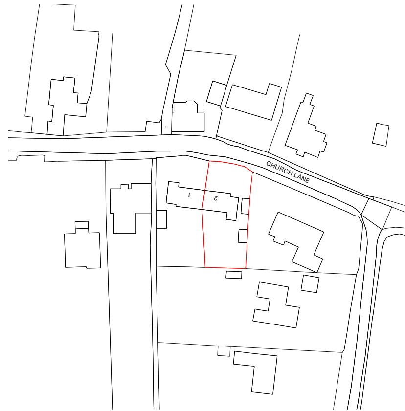
2 Location Plan 1 : 1250