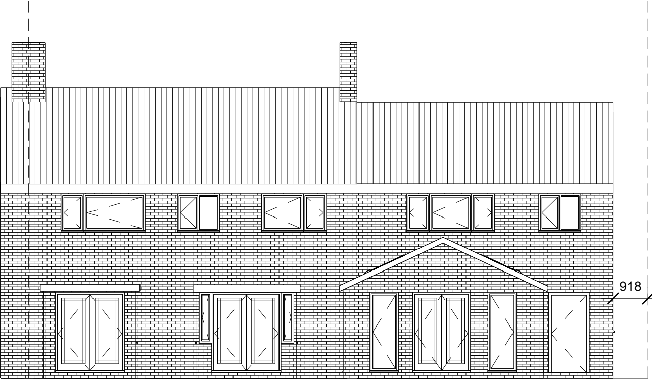
2 Proposed Rear Elevation 1 : 100