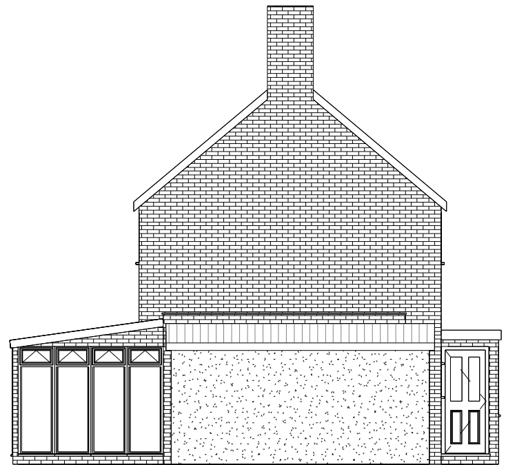
3 Existing Side B Elevation 1 : 100