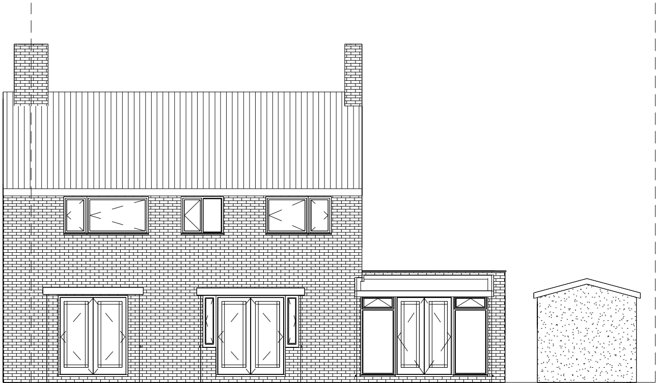
1 Existing Rear Elevation 1 : 100