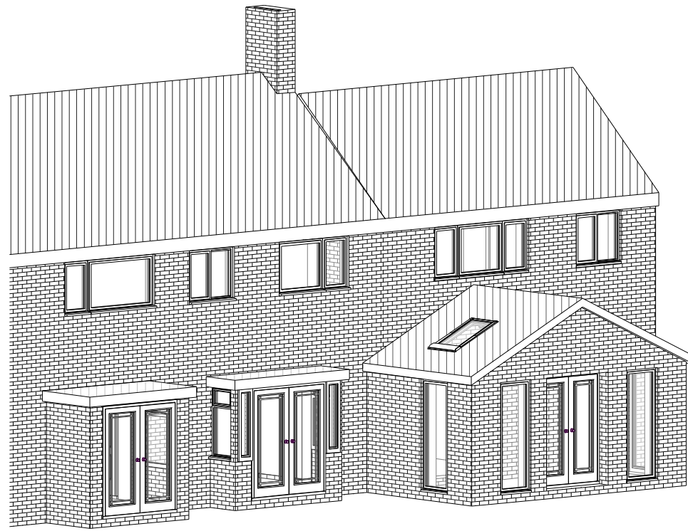
1 3D View 1