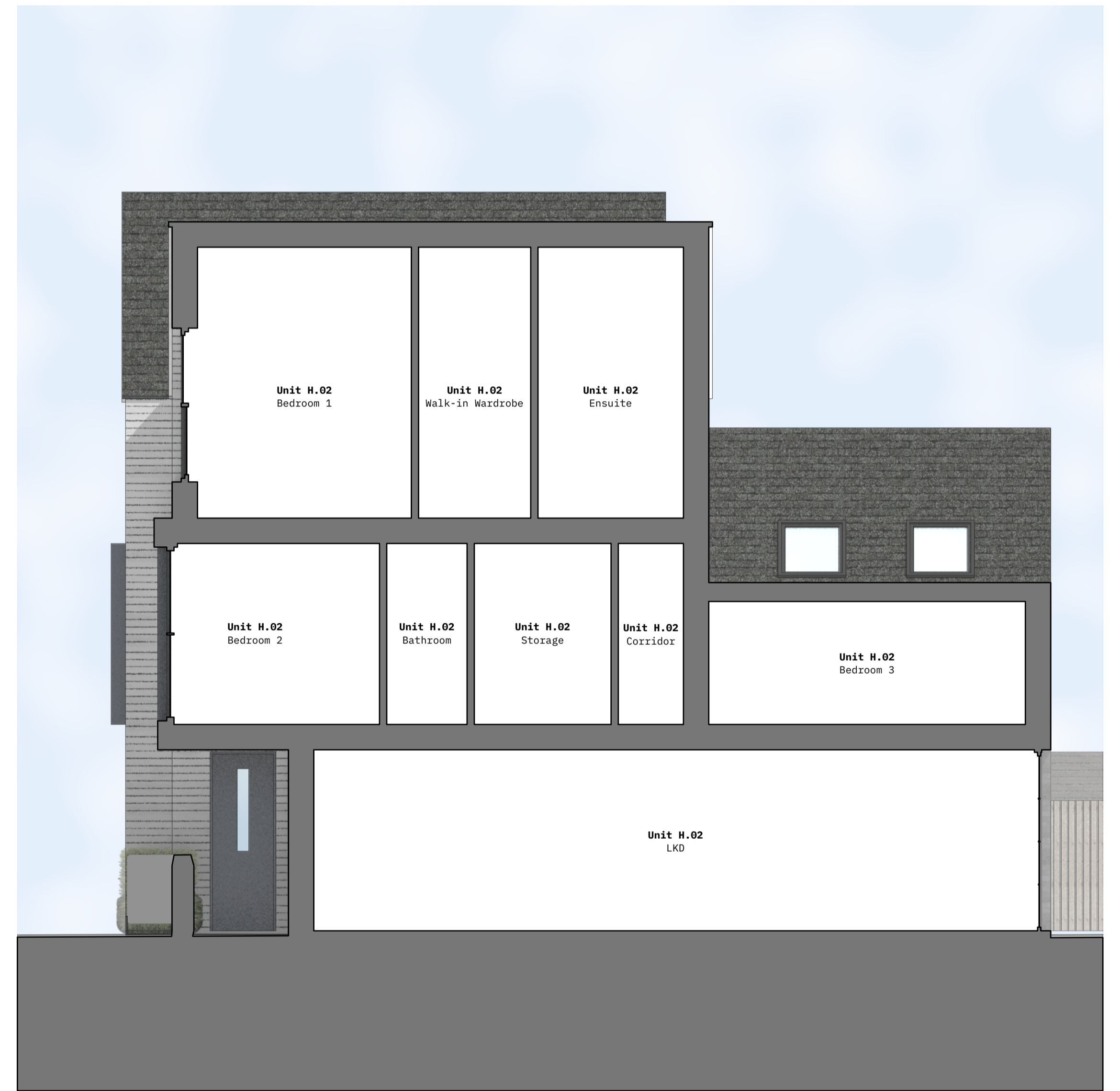
B Proposed Section B GS.01 1:50 @ A1; 1:100 @ A3