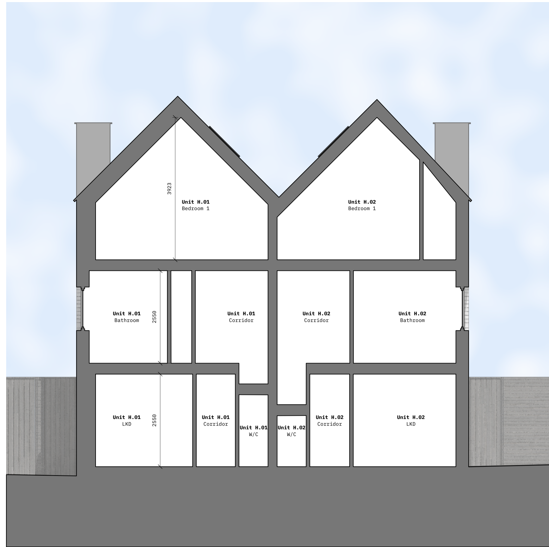
A Proposed Section A GS.01 1:50 @ A1; 1:100 @ A3