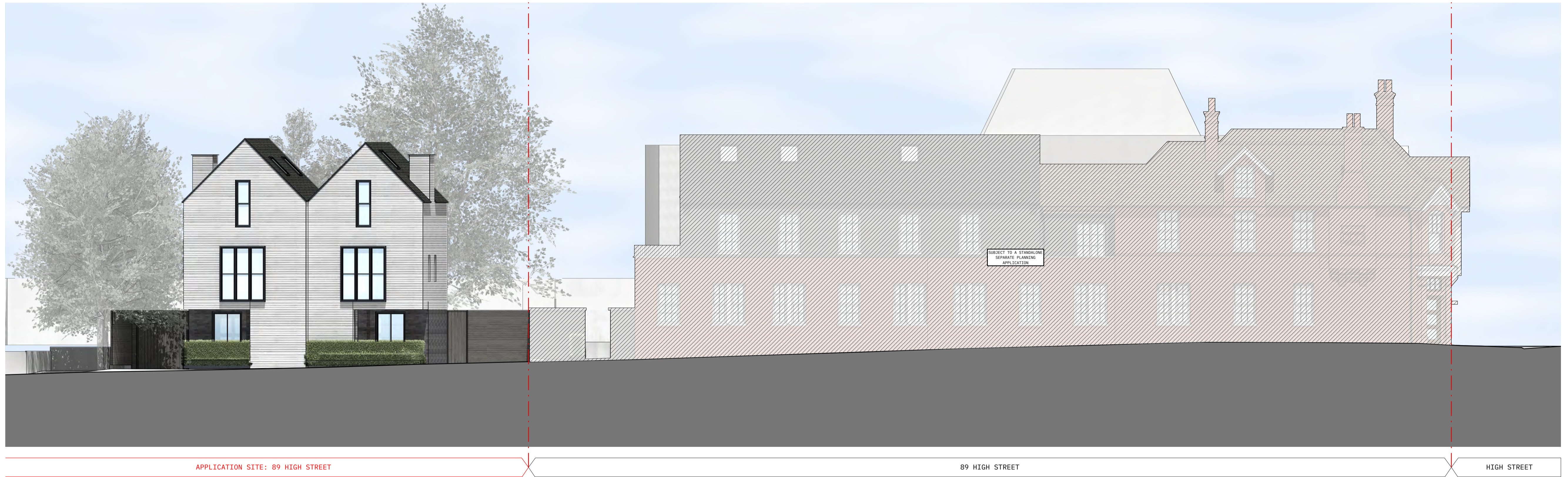
A Proposed South Site Elevation GE.20 1:100 @ A1 ; 1:200 @ A3