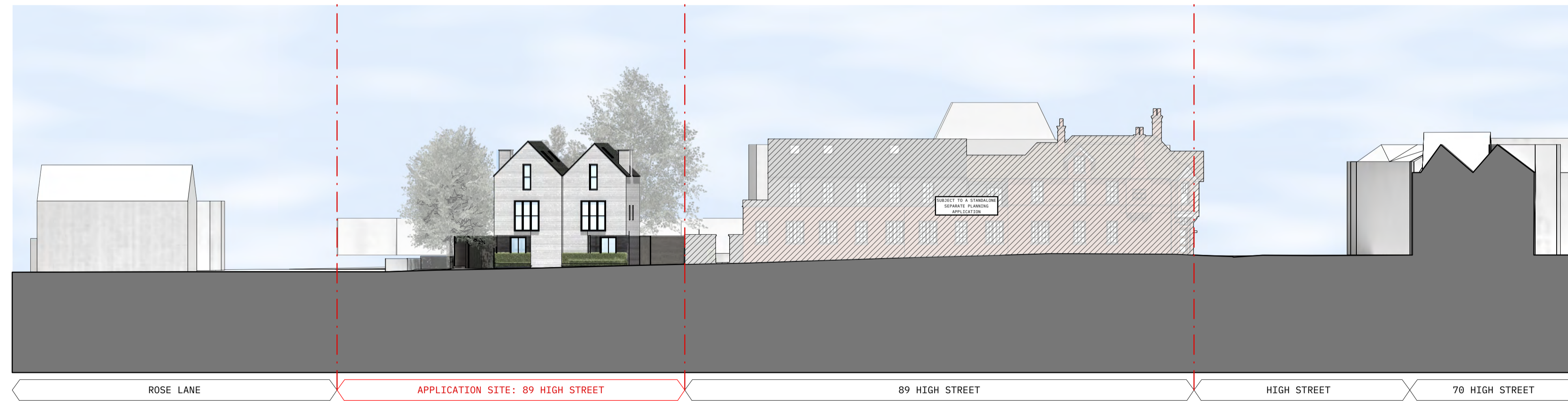
B Proposed Context Elevation GE.20 1:250 @ A1 1:500 @ A3