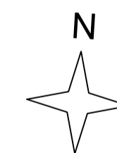
Proposed First Floor Plan – 1:50