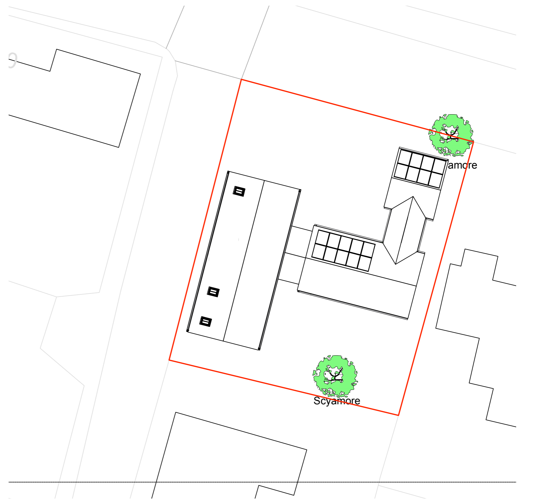
BLOCK PLAN 1:50