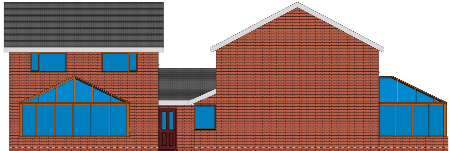
4 Existing Rear Elevation 1 : 50