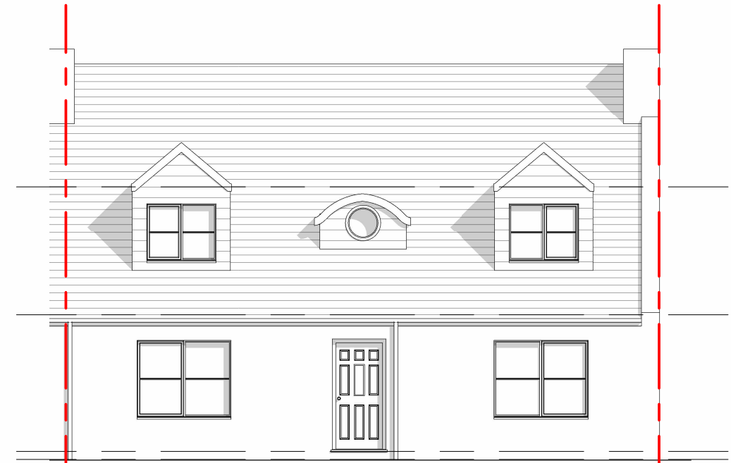
Proposed East Elevation 1 : 100