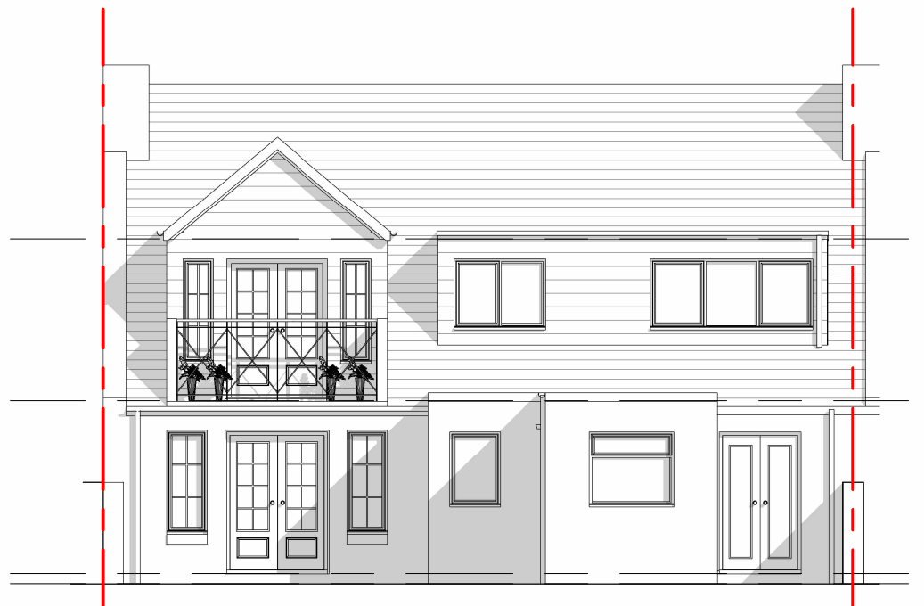
Proposed West Elevation 1 : 100