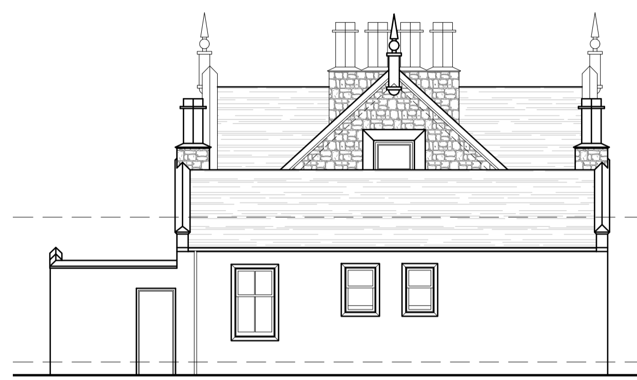
FRONT ELEVATION AS EXISTING SCALE 1/100