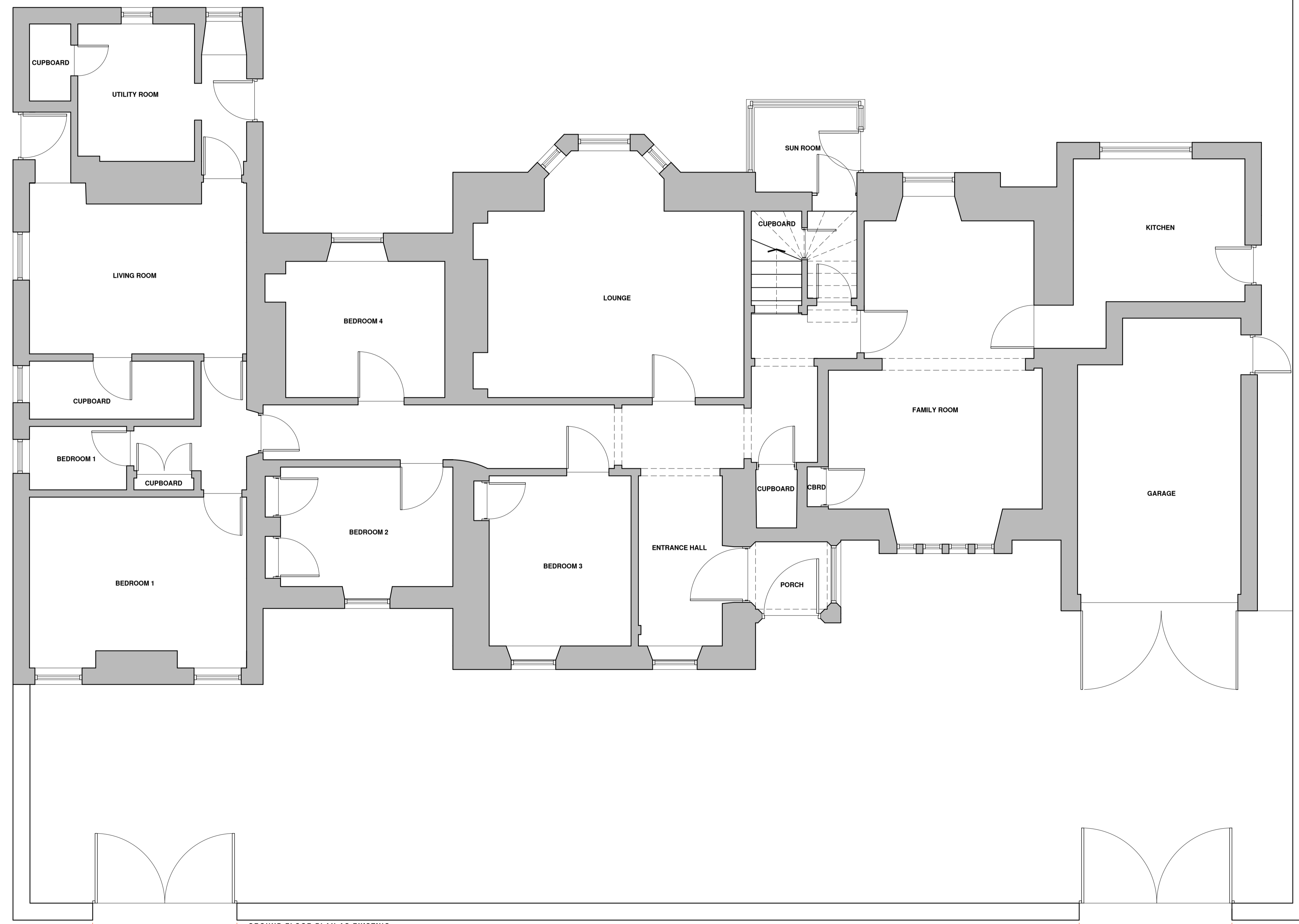
GROUND FLOOR PLAN AS EXISTING SCALE 1/50