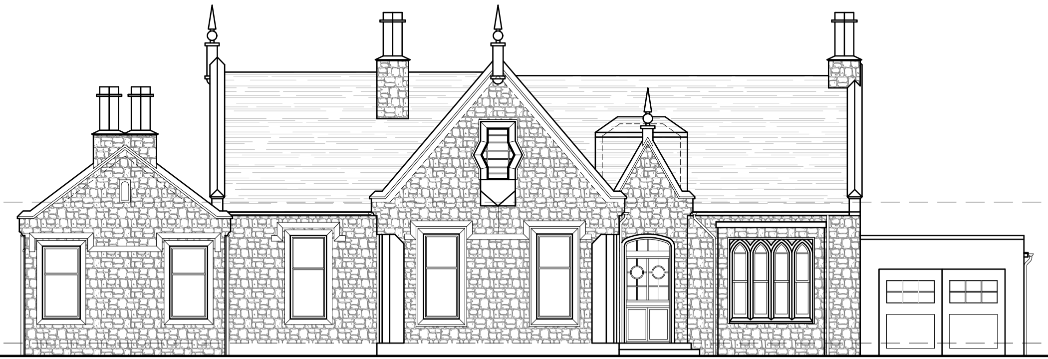
FRONT ELEVATION AS EXISTING SCALE 1/100