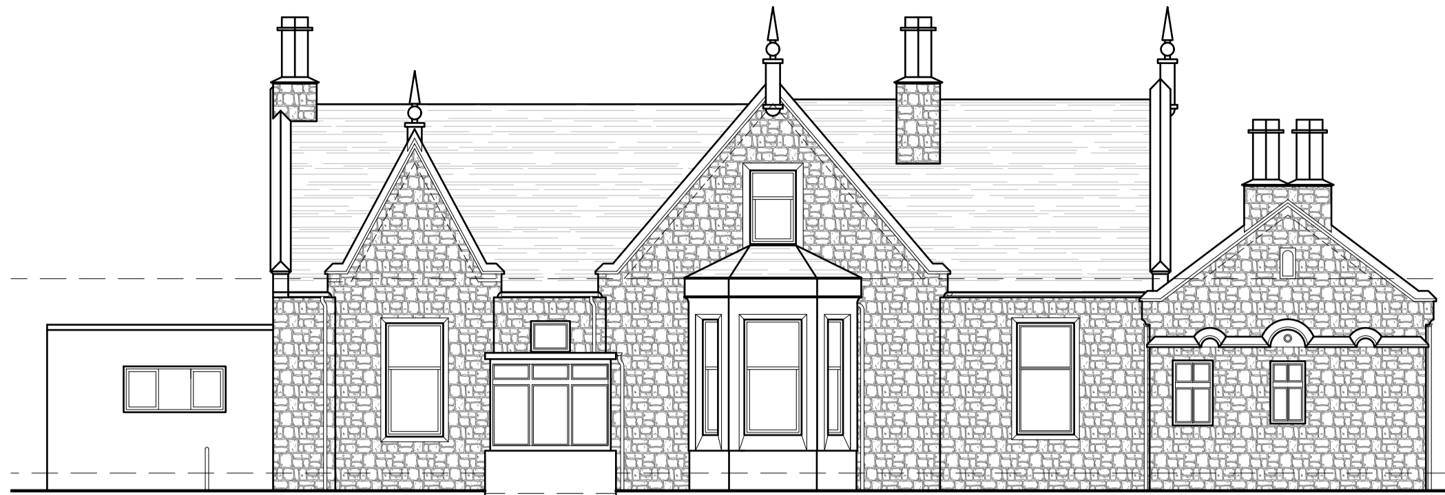
REAR ELEVATION AS EXISTING SCALE 1/100

This drawing, its contents and all information contained therein is protected by copyright. This drawing is for preliminary or planning purposes only unless specifically noted otherwise below, and does not constitute a construction issue drawing.