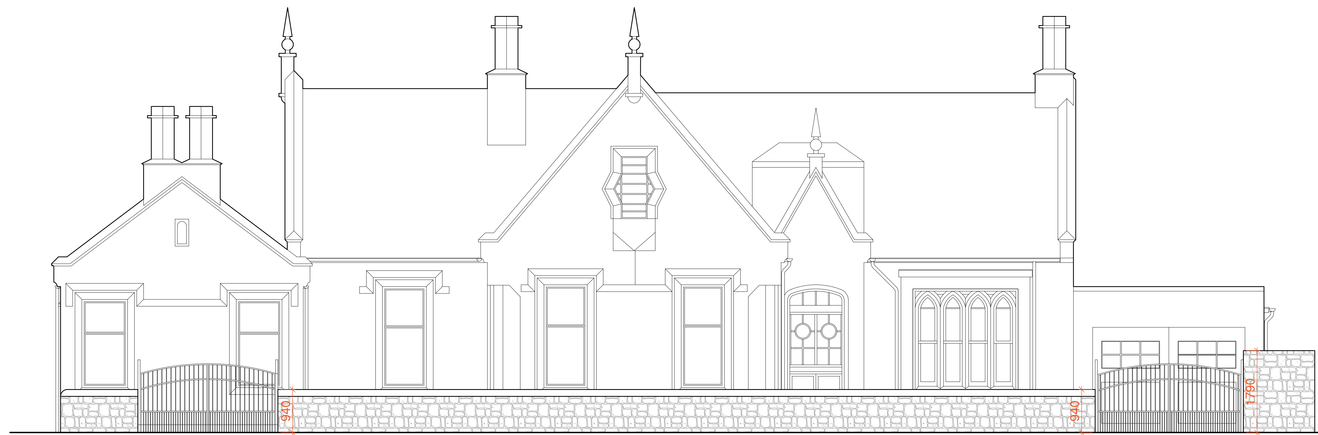
ENTRANCE ELEVATION AS EXISTING SCALE 1:50