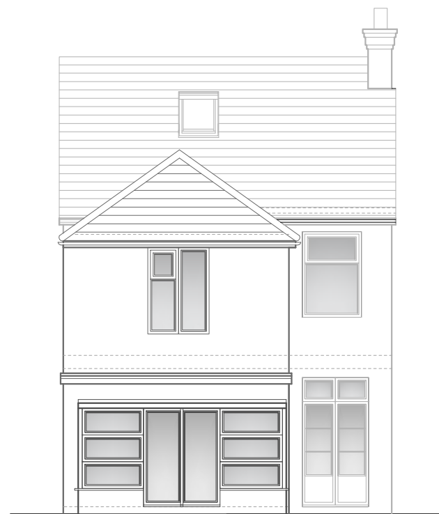
Rear Elevation Scale 1:100