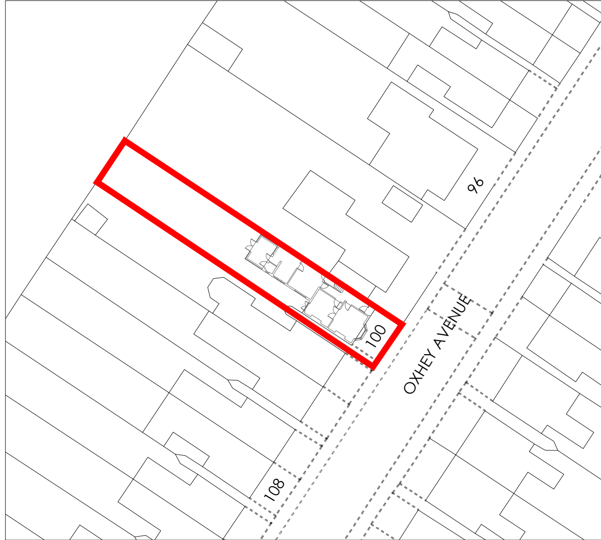
Site Plan Scale 1:500