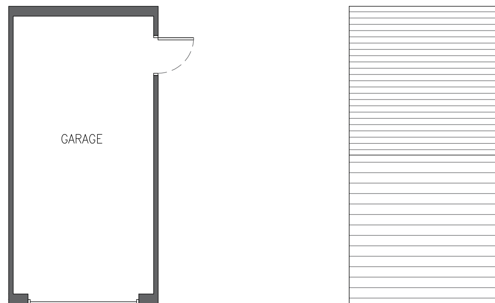
1:50 PROPOSED PLAN