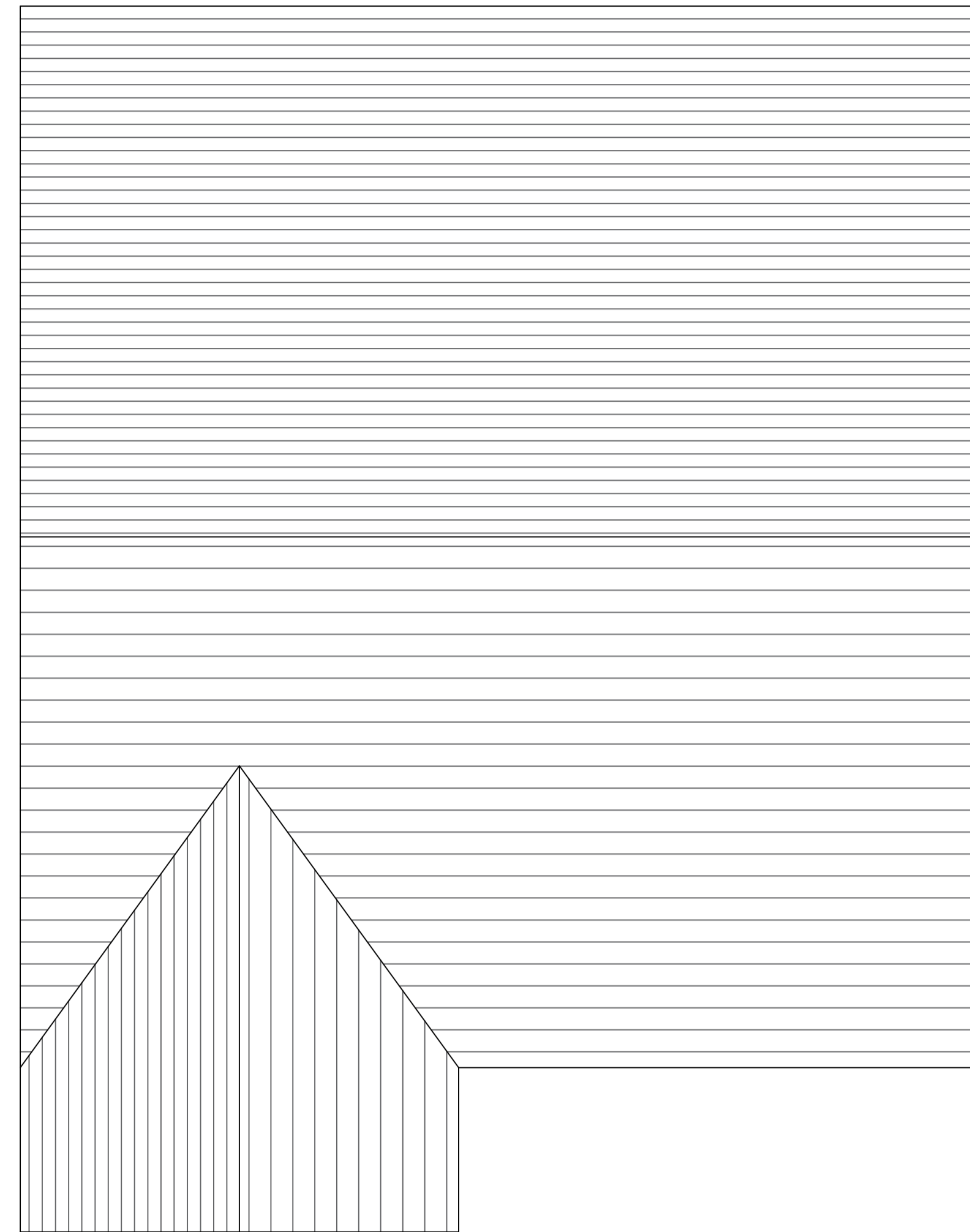
1:50 PROPOSED ROOF PLAN