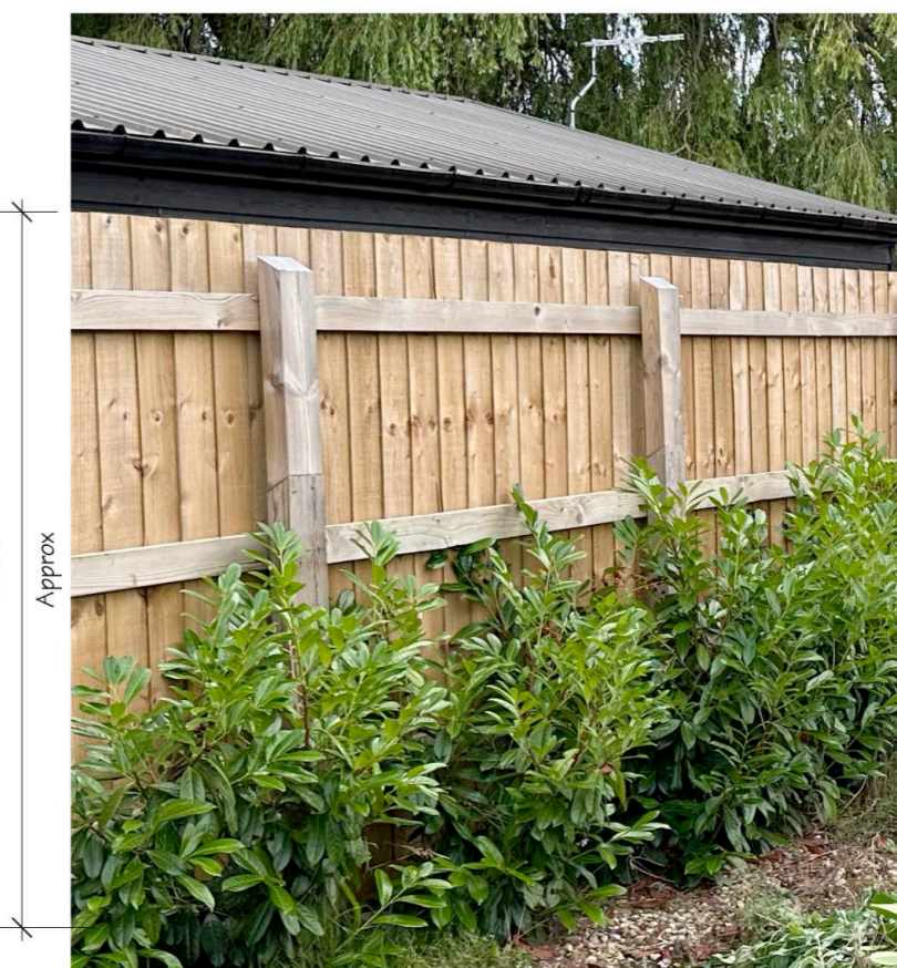
Proposed Close Boarded Fence