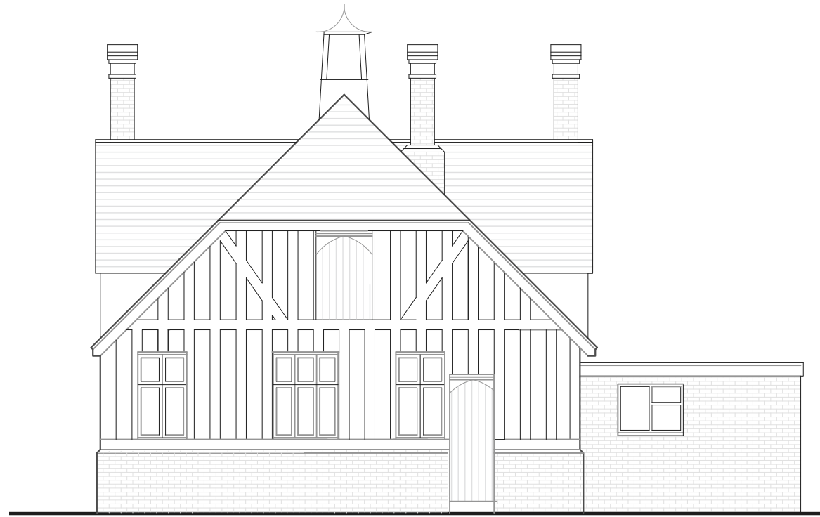
03 Existing East Elevation 1:100@A3