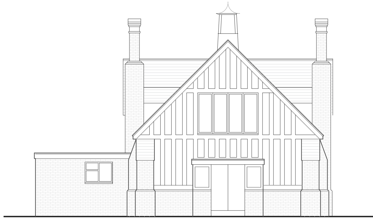
02 Existing West Elevation 1:100@A3