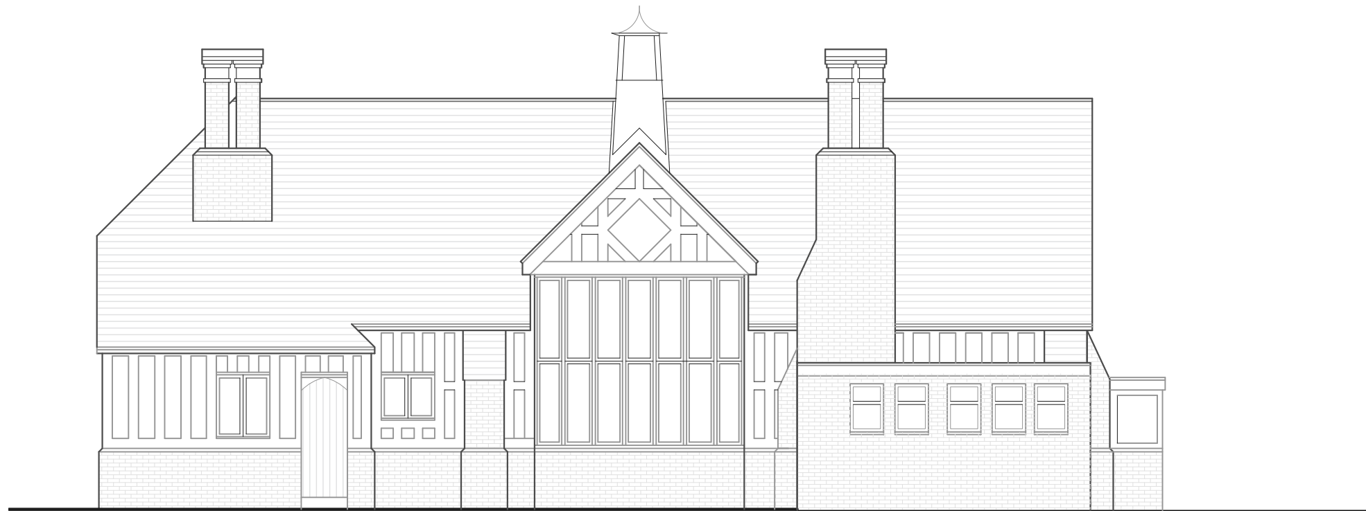
01 Existing South Elevation 1:100@A3