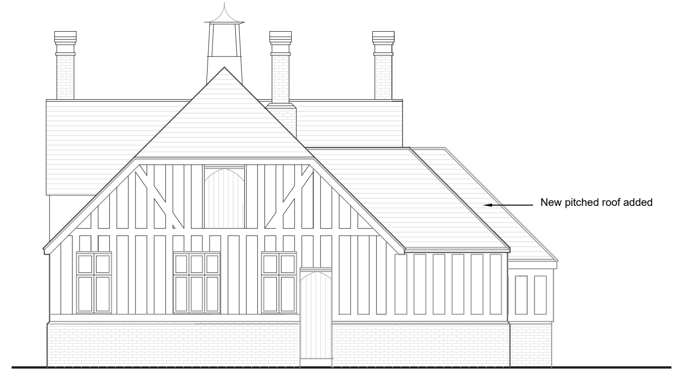
02 Proposed East Elevation 1:100@A3