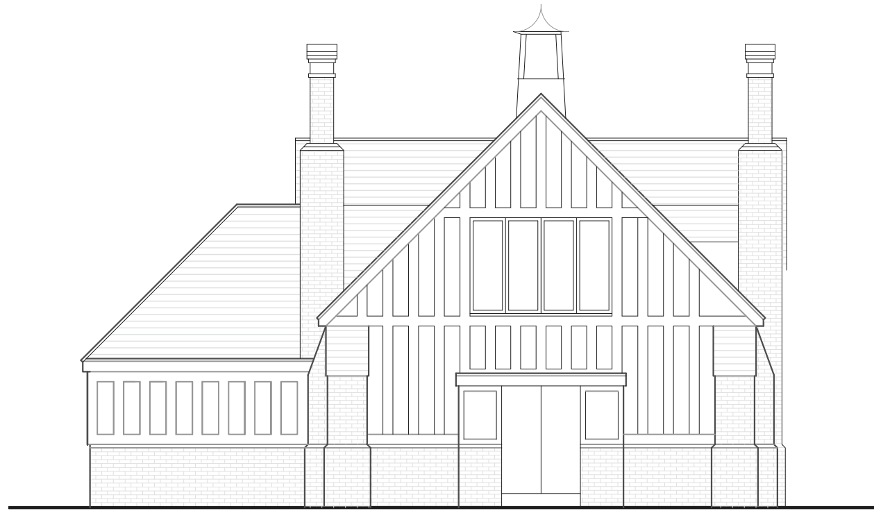
01 Proposed West Elevation 1:100@A3