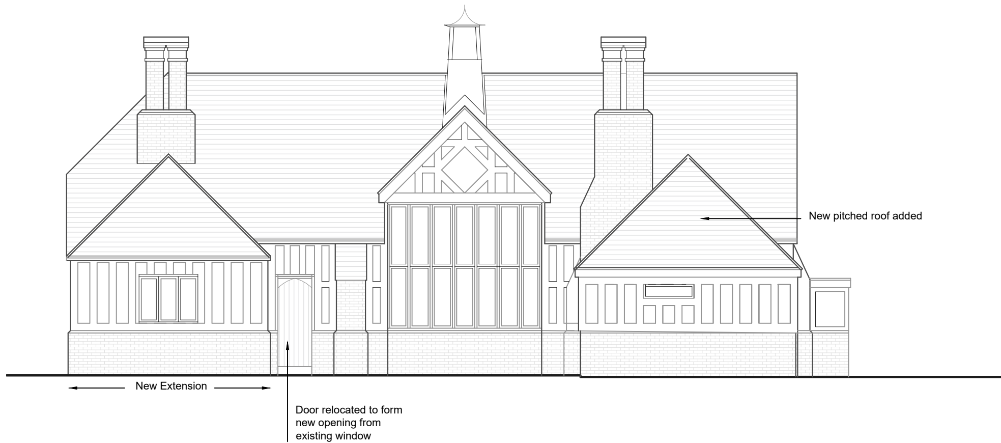
03 Proposed South Elevation 1:100@A3