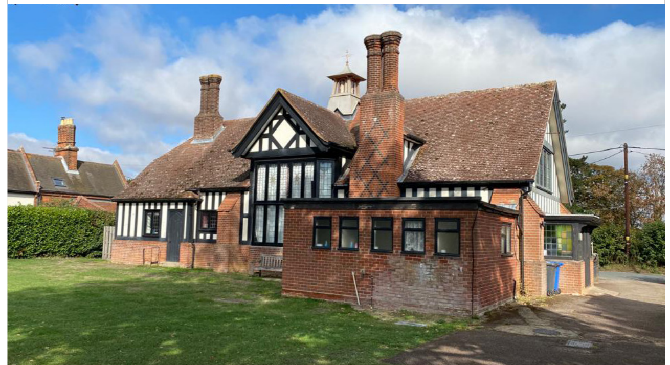
Rear Elevation photographs of Burstall Village Hall