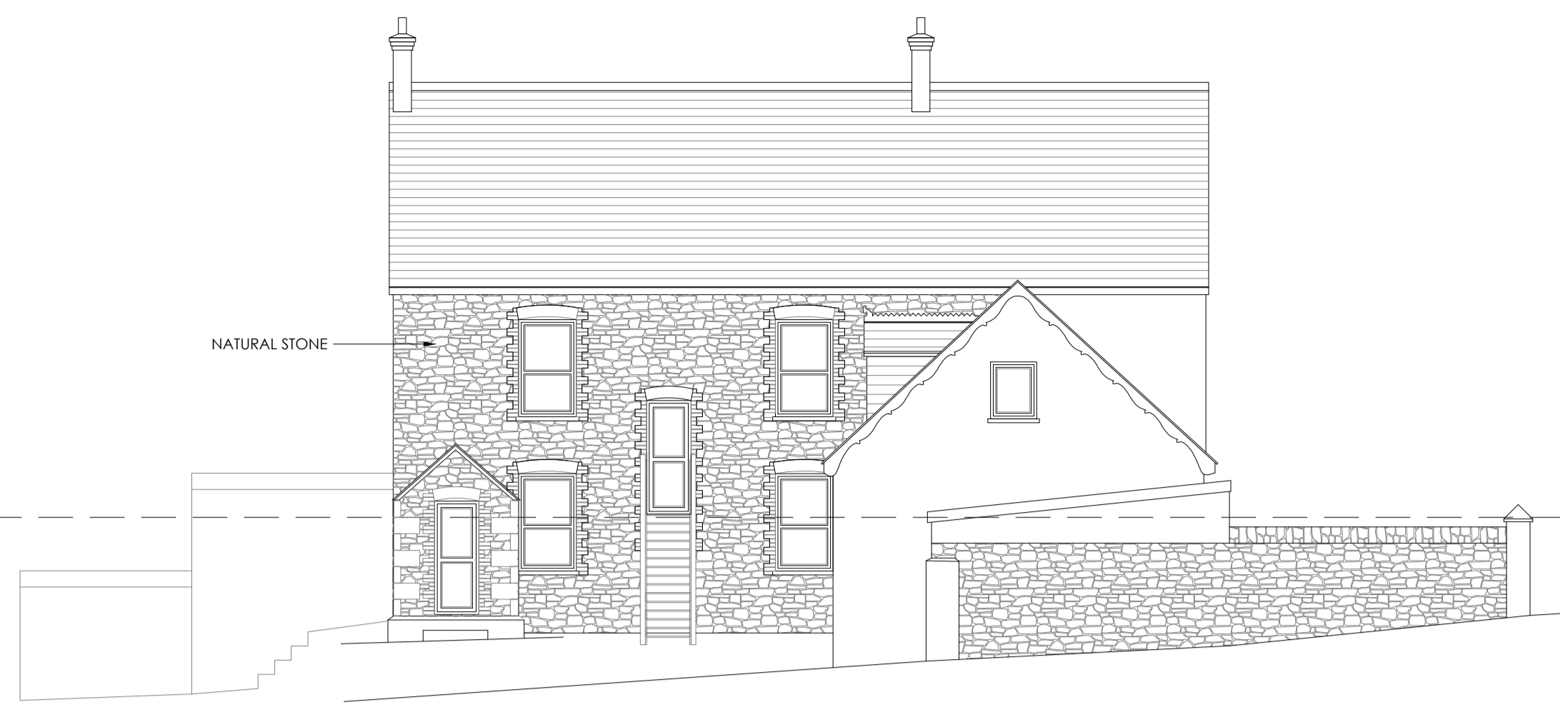
NORTH ELEVATION SCALE 1:100