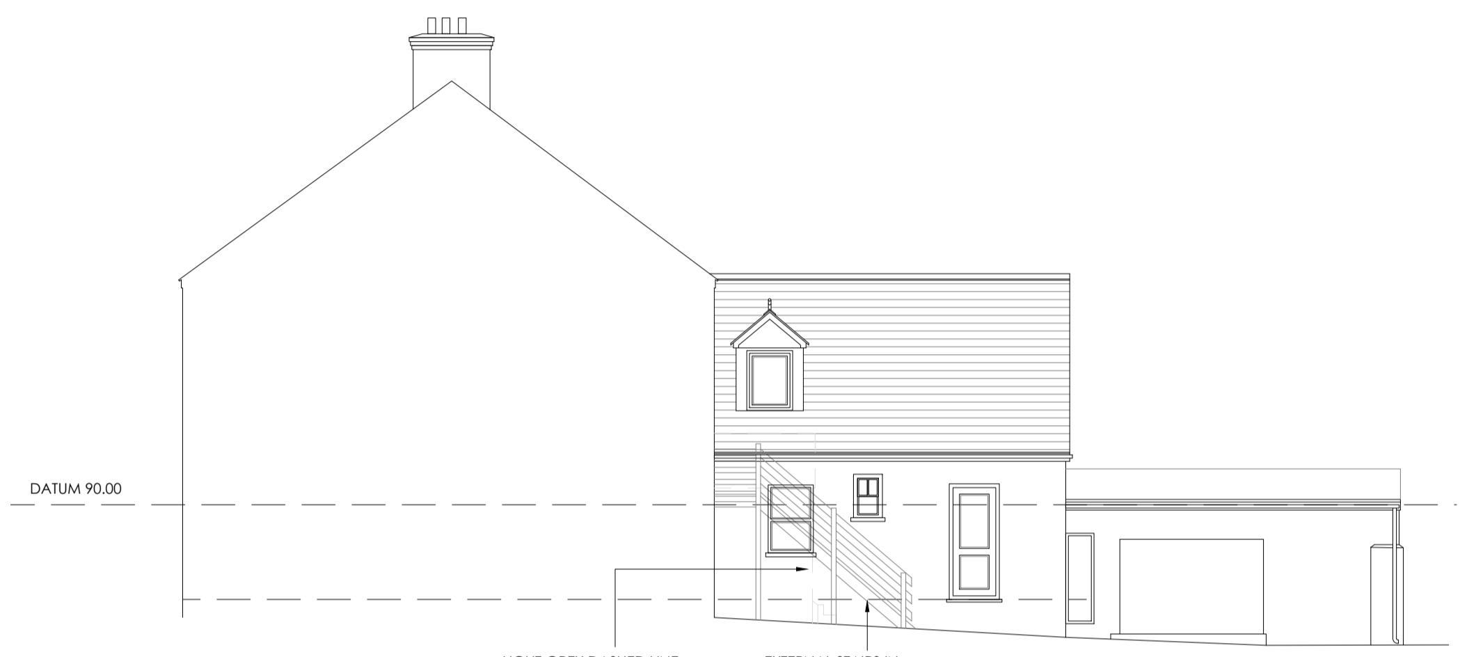
EAST ELEVATION SCALE 1:100