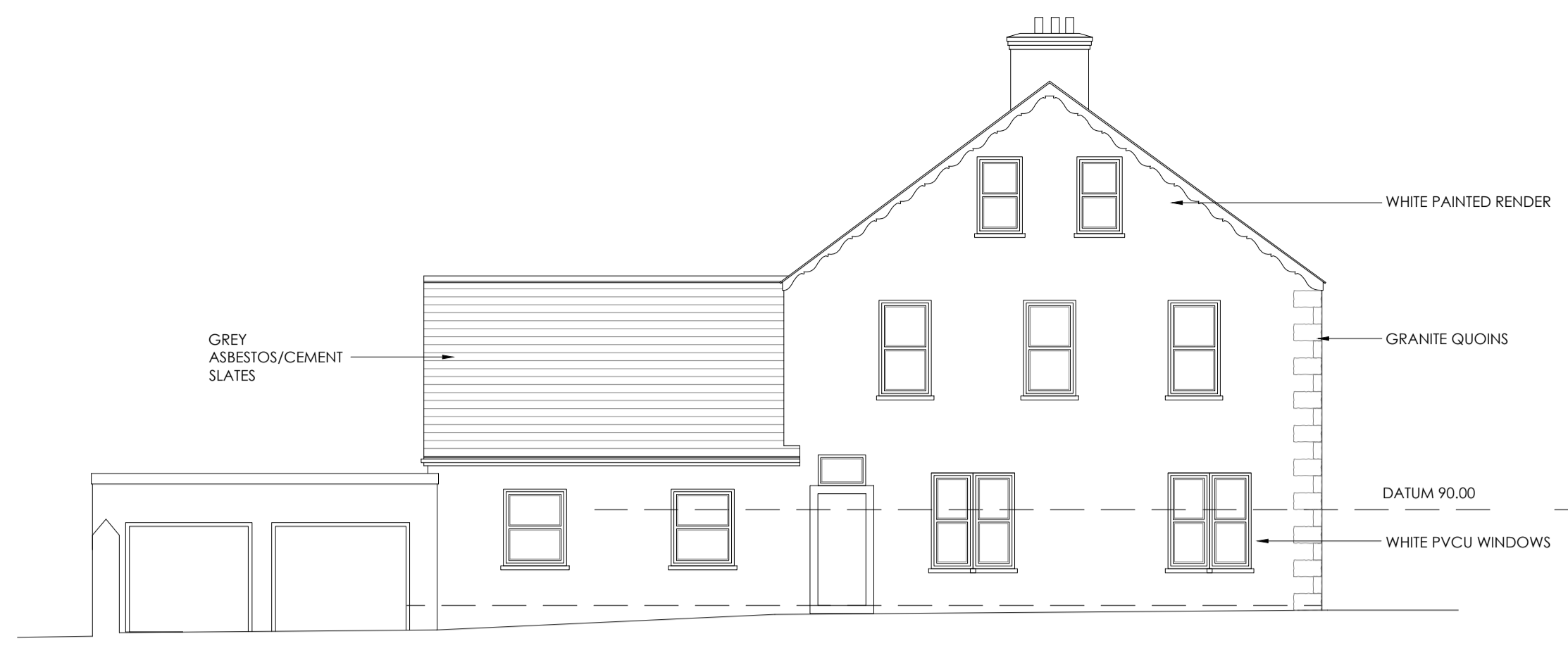
WEST ELEVATION SCALE 1:100