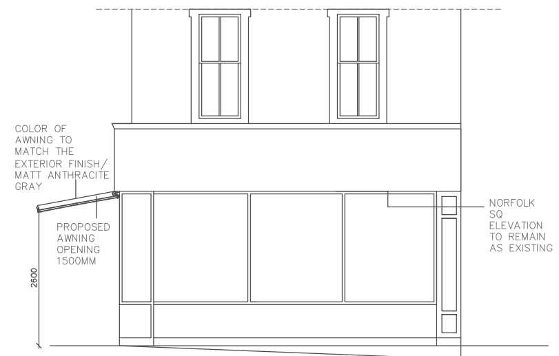
PROPOSED SIDE ELEVATION - NORFOLK SQUARE