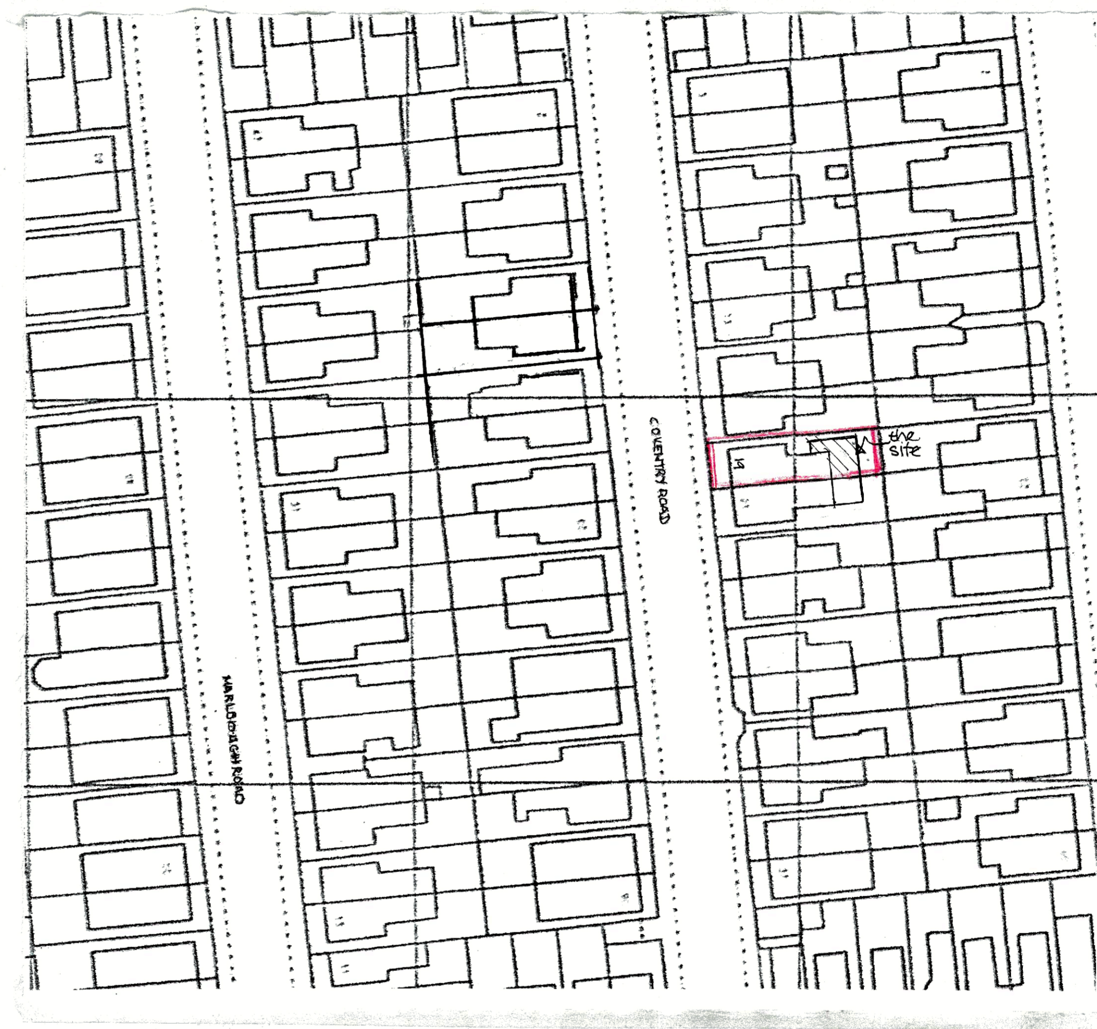
site plan 1:500